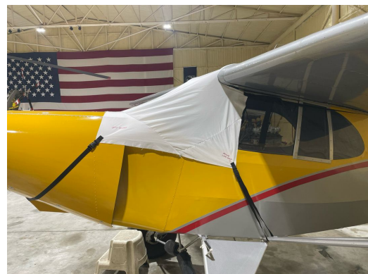
Piper J5A Windshield/Skylight Cover, test fit