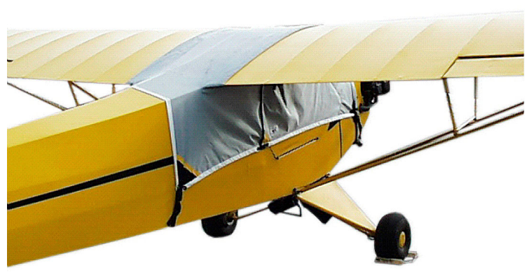
Piper J3 Over-Top Canopy Cover