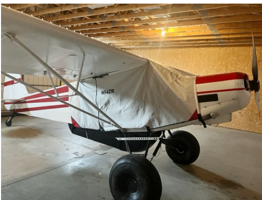
Piper PA-11 Extended Canopy Cover, Over the Top Style

This cover type is made from Silver Acrylic Sunbrella canvas and is 100% lined with a soft and smooth microfiber. Bruce's Custom Covers developed this material combination especially for aircraft protection. The outer material is medium weight and treated for water resistance, UV resistance and anti-static buildup. The inner lining is a very soft and smooth microfiber to prevent scratching. The material is very reflective, and tests show that the cabin interior temperature can be reduced to near-ambient temperature on the hottest of days. It is water, ice and snow repellent, yet breathable to allow moisture to escape from between the cover and the aircraft surface.