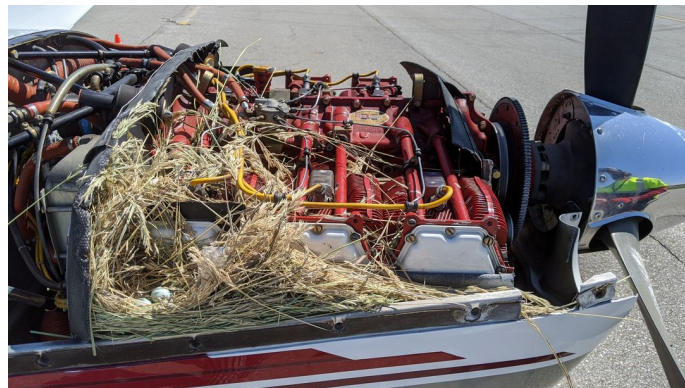
Piper Super Cub Insulated Engine Cover ENGINE PLUGS PREVENT BIRD NEST FOD. Piper Saratoga Engine Cowling Bird's Nest