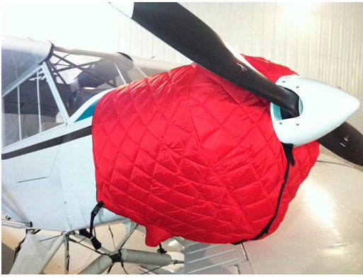
Piper Super Cub Insulated Engine Cover