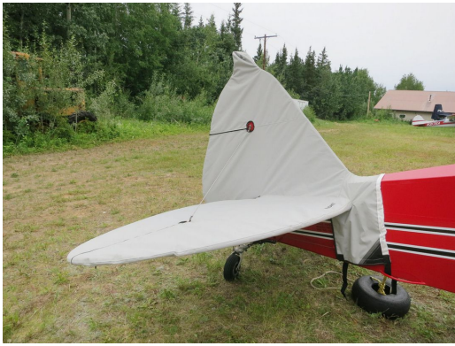
Piper PA-12 Abbreviated Empennage Cover