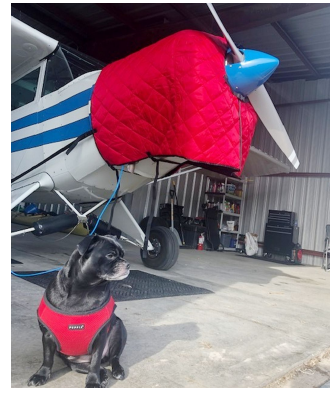
Piper PA-12 Insulated Hangar Blanket