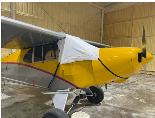
Piper J5A Windshield/Skylight Cover, test fit

This cover type is made from Silver Acrylic Sunbrella canvas and is 100% lined with a soft and smooth microfiber. Bruce's Custom Covers developed this material combination especially for aircraft protection. The outer material is medium weight and treated for water resistance, UV resistance and anti-static buildup. The inner lining is a very soft and smooth microfiber to prevent scratching. The material is very reflective, and tests show that the cabin interior temperature can be reduced to near-ambient temperature on the hottest of days. It is water, ice and snow repellent, yet breathable to allow moisture to escape from between the cover and the aircraft surface.