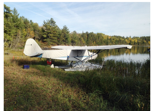
Piper PA-11 Cover Set