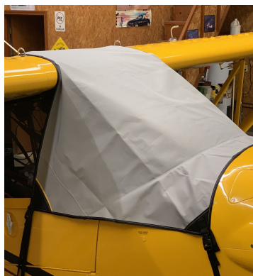
Cub Crafters Carbon Cub FX3 Windshield/Skylight Cover, travel weight

This cover type is made from Silver Acrylic Sunbrella canvas and is 100% lined with a soft and smooth microfiber. Bruce's Custom Covers developed this material combination especially for aircraft protection. The outer material is medium weight and treated for water resistance, UV resistance and anti-static buildup. The inner lining is a very soft and smooth microfiber to prevent scratching. The material is very reflective, and tests show that the cabin interior temperature can be reduced to near-ambient temperature on the hottest of days. It is water, ice and snow repellent, yet breathable to allow moisture to escape from between the cover and the aircraft surface.