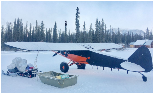
Piper PA-18 Super Cub Canopy Cover (Over-The-Top Style)