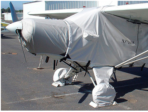
Piper PA-12 Landing Gear Covers