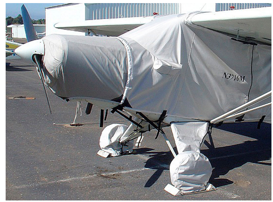
Piper PA-12 Landing Gear Covers