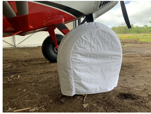
Cub Crafters CC19 Oversize Tire Covers, test fit cover