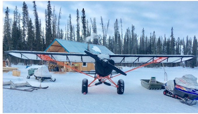
Piper PA-18 Super Cub Canopy Cover (Over-The-Top Style)