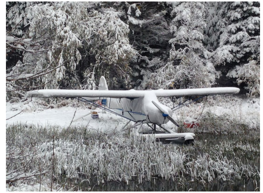
Piper PA-11 Cover Set