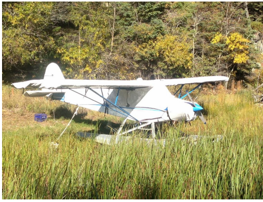
Piper PA-11 Cover Set