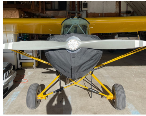
Piper PA-11 Replica Insulated Engine Cover