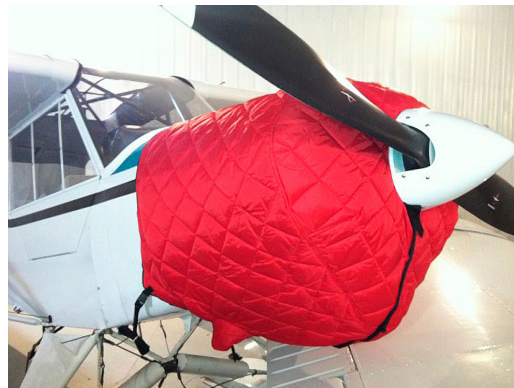
Piper Super Cub Insulated Engine Cover

Engine Inlet Plugs are custom fit for your Piper PA-11 Cub Special intakes, made with heavy-duty vinyl material, and stuffed with a single block of sculpted urethane foam. Each plug has a zipper that allows the foam to be removed and dried if necessary. Engine plugs have warning flags that are visible from the cockpit or 'remove before flight' streamers sewn onto the face of the plugs. Most plugs are imprinted with the aircraft registration number in black for an extra charge. Storage bag NOT included. Engine plugs may be inserted after flight when the engine is still warm. Engine Inlet Plugs are commonly referred to as Cowl Plugs, Intake Plugs, Cowl Blocks, Engine Blocks, and Engine Bungs.