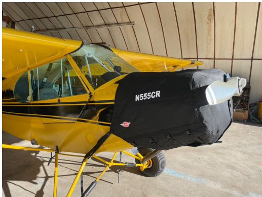
Piper PA-11 Replica Insulated Engine Cover

This cover type is made from Silver Acrylic Sunbrella canvas and is 100% lined with a soft and smooth microfiber. Bruce's Custom Covers developed this material combination especially for aircraft protection. The outer material is medium weight and treated for water resistance, UV resistance and anti-static buildup. The inner lining is a very soft and smooth microfiber to prevent scratching. The material is very reflective, and tests show that the cabin interior temperature can be reduced to near-ambient temperature on the hottest of days. It is water, ice and snow repellent, yet breathable to allow moisture to escape from between the cover and the aircraft surface.