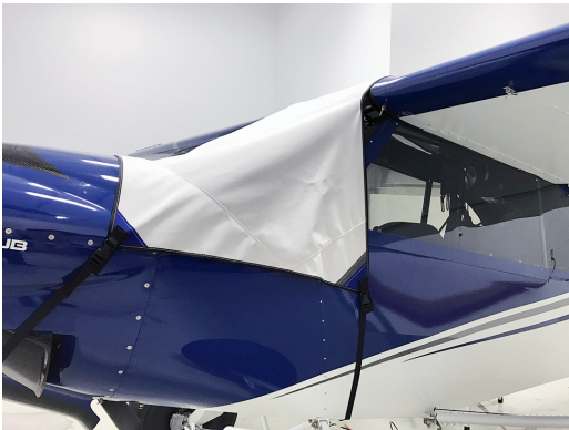
Cub Crafters CC-11 Windshield Cover

This cover type is made from Silver Acrylic Sunbrella canvas and is 100% lined with a soft and smooth microfiber. Bruce's Custom Covers developed this material combination especially for aircraft protection. The outer material is medium weight and treated for water resistance, UV resistance and anti-static buildup. The inner lining is a very soft and smooth microfiber to prevent scratching. The material is very reflective, and tests show that the cabin interior temperature can be reduced to near-ambient temperature on the hottest of days. It is water, ice and snow repellent, yet breathable to allow moisture to escape from between the cover and the aircraft surface.