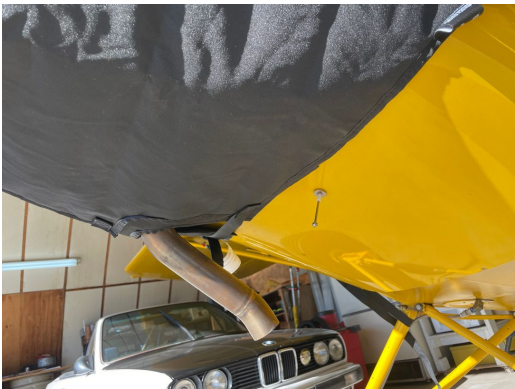
Piper PA-11 Replica Insulated Engine Cover