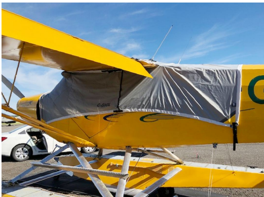
Piper PA-12 Super Cruiser Over-Top Canopy Cover Sportsman 2+2 Wag Aero Light Weight Over the Top Travel Canopy Cover