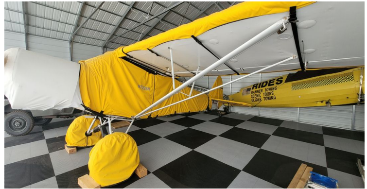
Piper PA-18 Complete Cover Set