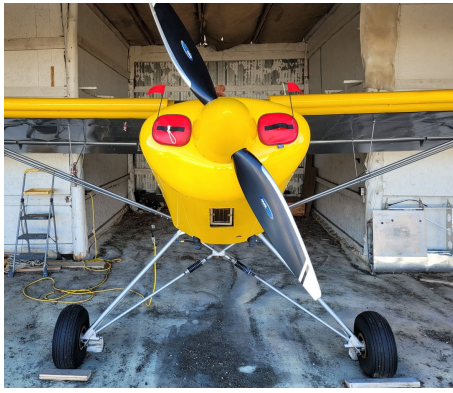
Preceptor STOL King Engine Plugs