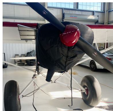
Piper PA-18 Super Cub Insulated Engine Cover