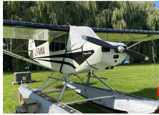
Piper PA-18 Super Cub Windshield/Skylight Cover