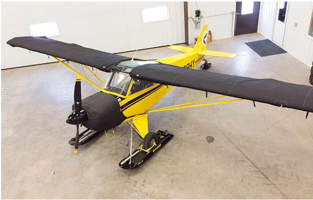
Aviat Husky Insulated Engine Cover, Wing Covers

WINTER USE MATERIAL - Made with Solution-Dyed Polyester fabric, this option is intended for seasonal use to aid in deicing, rain mitigation, or for occasional travel. The material is lighter and more compact, but more susceptible to UV damage and may have a shorter useful life if used continuously outside than the all-year use material.