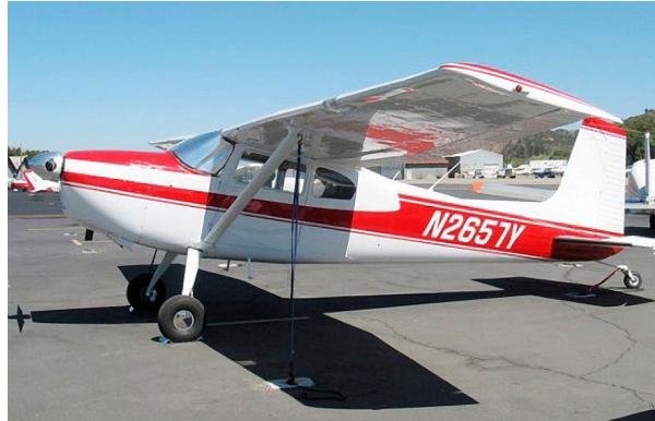
Cessna 180 & 185 Windshield HeatShield

Windshield Heatshields are interior sunshades for an aircraft's front windshield. The product is a unique composite of closed-cell foam with a silver mylar finish. The semi-rigid design is stiff enough to stand along the inside of the windshield using sun visors or window framing. It folds up flat and easily stores in the included storage sleeve. Some designs may require velcro and suction cups or split right and left sides. A Heatshield is an excellent short-term remedy for cockpit overheating. An external fabric cover is far more effective and practical for long-term protection.