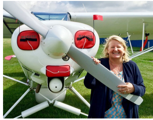
Piper PA-18 Super Cub Engine Inlet Plugs