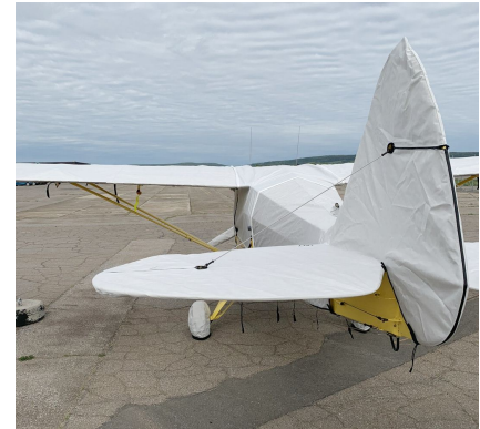
Piper PA-22 Tri-Pacer Empennage Cover