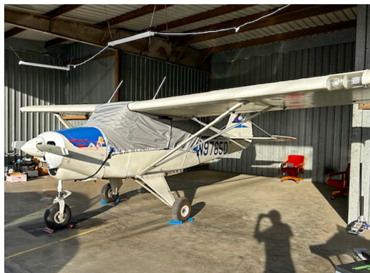
Piper PA-22-150 Travel Canopy Cover

Travel Covers are made with Silver Solution-Dyed Polyester fabric and only lined over the windshield to save weight. The material is lightweight and more compact for easy stowage in the aircraft. The polyester material is water resistant, but only intended for occasional use outside. We also have an ultra lightweight material available for fitted hangar dust covers. For daily outdoor use, the non-travel Sunbrella Cover is the best choice.