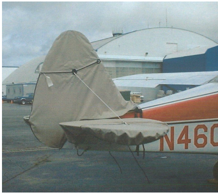
Piper PA-22 Colt Horizontal & Vertical Stabilizer Covers