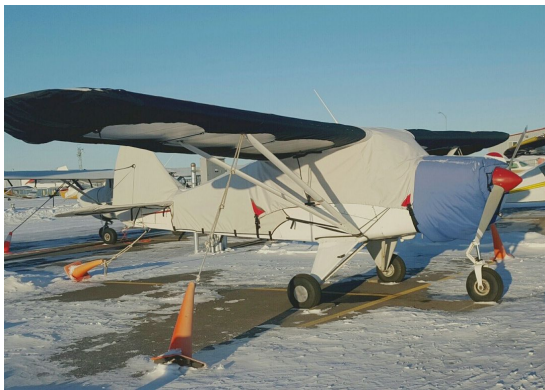
PA-20 Cover Set

This cover type is made from Silver Acrylic Sunbrella canvas and is 100% lined with a soft and smooth microfiber. Bruce's Custom Covers developed this material combination especially for aircraft protection. The outer material is medium weight and treated for water resistance, UV resistance and anti-static buildup. The inner lining is a very soft and smooth microfiber to prevent scratching. The material is very reflective, and tests show that the cabin interior temperature can be reduced to near-ambient temperature on the hottest of days. It is water, ice and snow repellent, yet breathable to allow moisture to escape from between the cover and the aircraft surface.