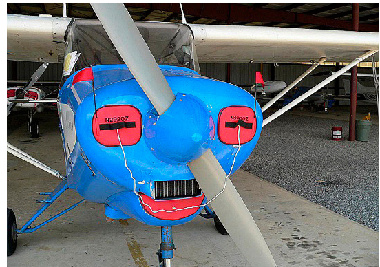
Piper PA-22-150 Engine Inlet Plugs (set of 3)