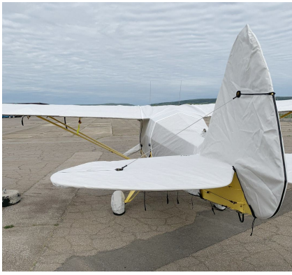
Piper PA-22 Tri-Pacer Empennage Cover