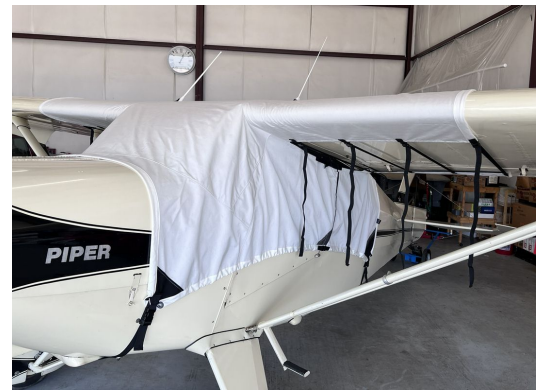
Piper Tri-Pacer Canopy Cover with 36" wing ext.