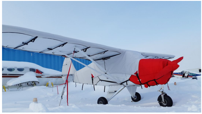
1957 PA-22-150 Over the Top Style Canopy Cover