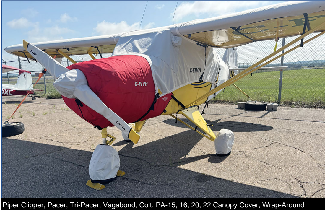
Piper Clipper, Pacer, Tri-Pacer, Vagabond, Colt: PA-15, 16, 20, 22 Canopy Cover, Wrap-Around