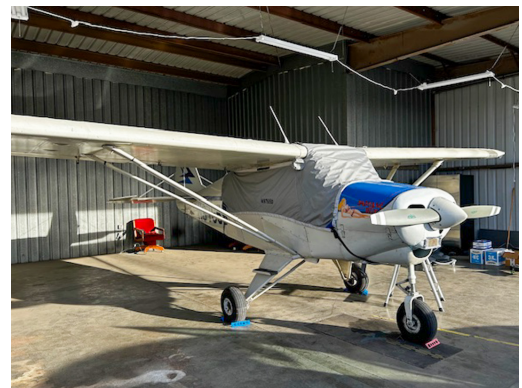
Piper PA-22-150 Travel Canopy Cover