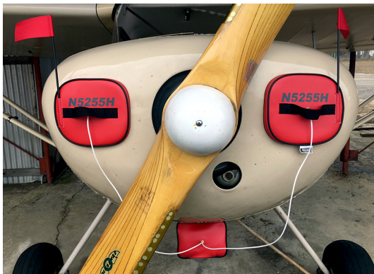
Piper PA-16 Engine Inlet Plugs

Engine Inlet Plugs are custom fit for your Piper Clipper, Pacer, Tri-Pacer, Vagabond, Colt: PA-15, 16, 20, 22 intakes, made with heavy-duty vinyl material, and stuffed with a single block of sculpted urethane foam. Each plug has a zipper that allows the foam to be removed and dried if necessary. Engine plugs have warning flags that are visible from the cockpit or 'remove before flight' streamers sewn onto the face of the plugs. Most plugs are imprinted with the aircraft registration number in black for an extra charge. Storage bag NOT included. Engine plugs may be inserted after flight when the engine is still warm. Engine Inlet Plugs are commonly referred to as Cowl Plugs, Intake Plugs, Cowl Blocks, Engine Blocks, and Engine Bunges.