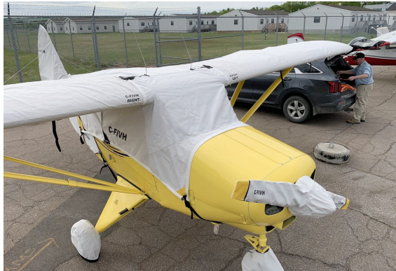
Piper PA-22 Tri-Pacer Cover Set

ALL-YEAR USE MATERIAL - Made with Silver Acrylic Sunbrella canvas, the all-year use material is the best option for sun protection and cover longevity. This heavier more durable material is intended for all weather conditions, such as rain and snow or lots of sun.