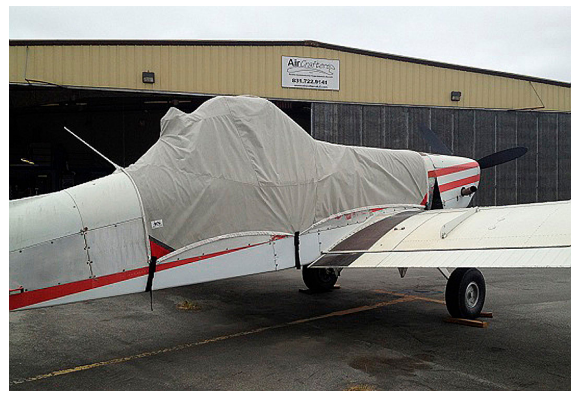
Piper Brave PA-36 Canopy/Hopper Cover