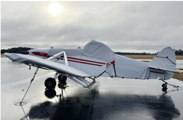
Piper Pawnee Canopy/Hopper, Wing & Empennage Covers

WINTER USE MATERIAL - Made with Solution-Dyed Polyester fabric, this option is intended for seasonal use to aid in deicing, rain mitigation, or for occasional travel. The material is lighter and more compact, but more susceptible to UV damage and may have a shorter useful life if used continuously outside than the all-year use material.