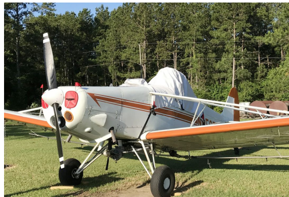
Piper Pawnee PA-25 Canopy/Hopper Cover, Engine Plugs