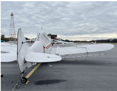
Piper PA-25 Pawnee Cover Set

WINTER USE MATERIAL - Made with Solution-Dyed Polyester fabric, this option is intended for seasonal use to aid in deicing, rain mitigation, or for occasional travel. The material is lighter and more compact, but more susceptible to UV damage and may have a shorter useful life if used continuously outside than the all-year use material.