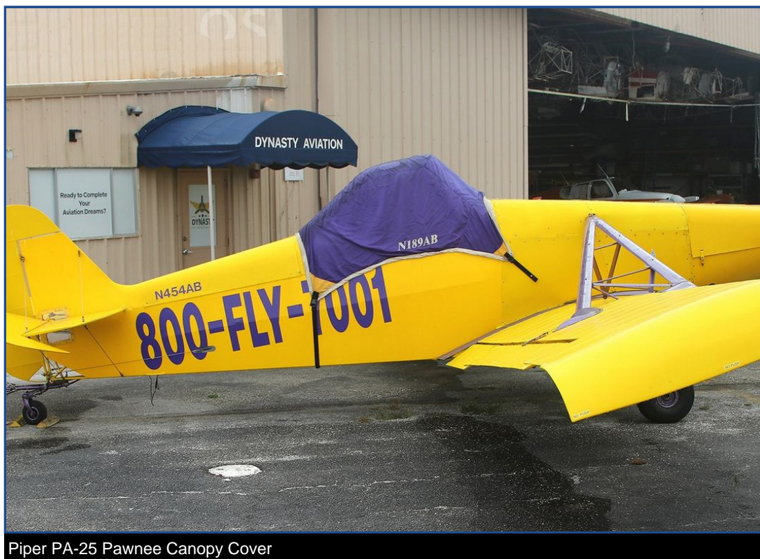
Piper PA-25 Pawnee Canopy Cover