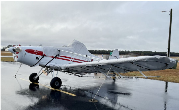
Piper Pawnee Canopy/Hopper, Wing & Empennage Covers