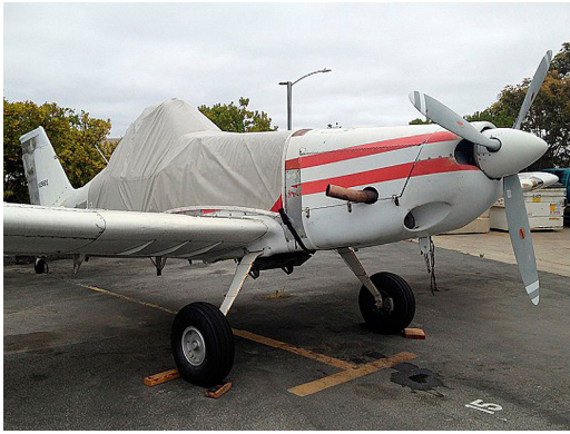
Piper Brave PA-36 Canopy/Hopper Cover

occasional use outside. We also have an ultra lightweight material available for fitted hangar dust covers. For daily outdoor use, the non-travel Sunbrella Cover is the best choice.