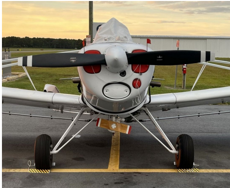
Piper PA-25 Pawnee Canopy/Hopper Cover