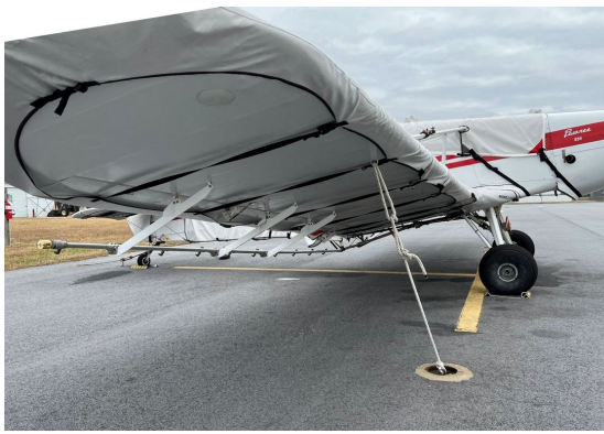
Piper PA-25 Pawnee Cover Set