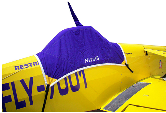
Piper Pawnee Canopy Cover