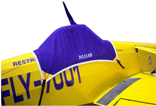
Piper Pawnee Canopy Cover