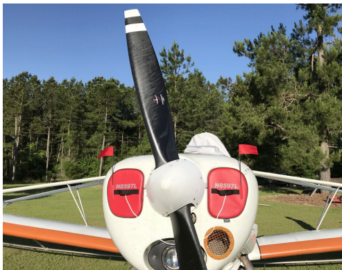
Piper Pawnee PA-25 Engine Inlet Plugs

Engine Inlet Plugs are custom fit for your Piper Pawnee PA-25 intakes, made with heavy-duty vinyl material, and stuffed with a single block of sculpted urethane foam. Each plug has a zipper that allows the foam to be removed and dried if necessary. Engine plugs have warning flags that are visible from the cockpit or 'remove before flight' streamers sewn onto the face of the plugs. Most plugs are imprinted with the aircraft registration number in black for an extra charge. Storage bag NOT included. Engine plugs may be inserted after flight when the engine is still warm. Engine Inlet Plugs are commonly referred to as Cowl Plugs, Intake Plugs, Cowl Blocks, Engine Blocks, and Engine Bungs.