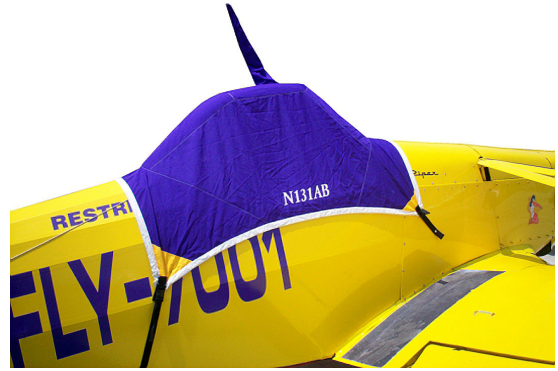
Piper Pawnee Canopy Cover