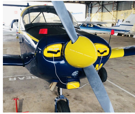
Piper PA-38 Tomahawk Engine Inlet Plugs with custom color