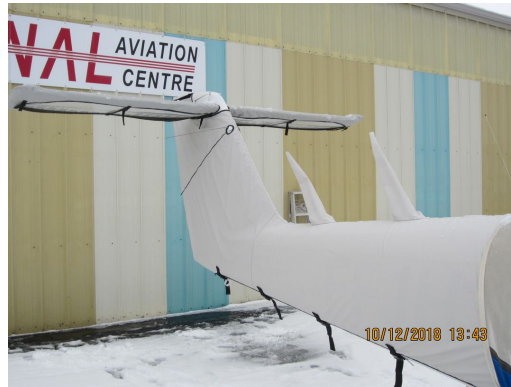
Piper PA-38 Tomahawk Empennage Cover (Tailboom, Vertical & Horiz Stabilizers) Set (W/Horiz. Stab. Cover), Winter Use

WINTER USE MATERIAL - Made with Solution-Dyed Polyester fabric, this option is intended for seasonal use to aid in deicing, rain mitigation, or for occasional travel. The material is lighter and more compact, but more susceptible to UV damage and may have a shorter useful life if used continuously outside than the all-year use material.