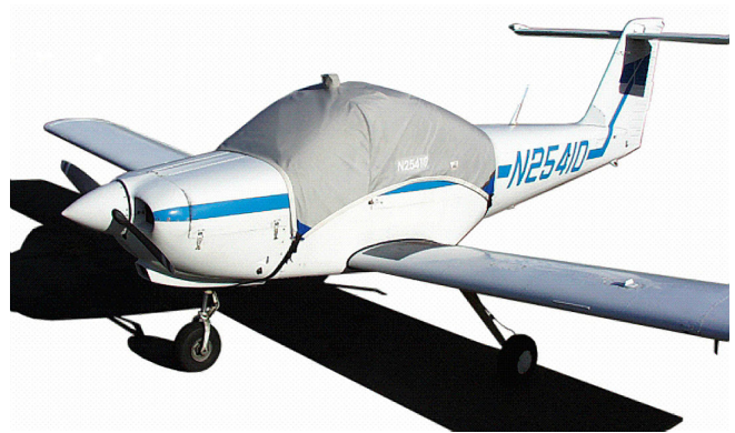
Piper Tomahawk Canopy Cover