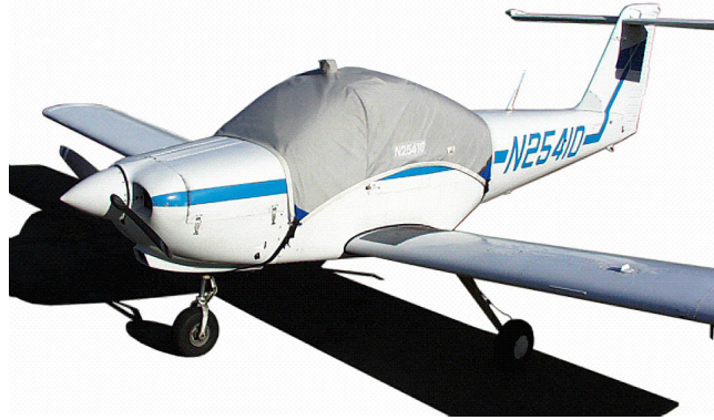
Piper Tomahawk Canopy Cover

Travel Covers are made with Silver Solution-Dyed Polyester fabric and only lined over the windshield to save weight. The material is lightweight and more compact for easy stowage in the aircraft. The polyester material is water resistant, but only intended for occasional use outside. We also have an ultra lightweight material available for fitted hangar dust covers. For daily outdoor use, the non-travel Sunbrella Cover is the best choice.