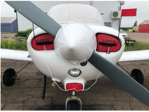
Piper PA-38 Tomahawk Engine Plugs