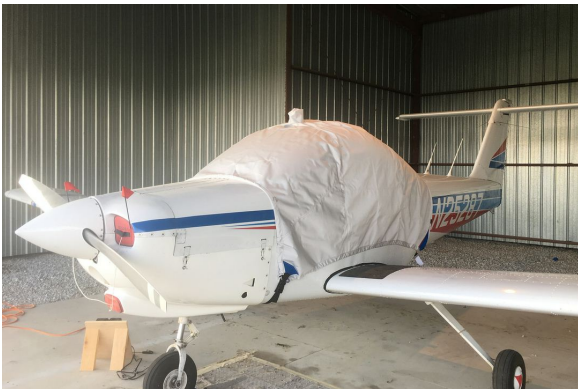
Piper PA-38 Canopy Cover

This cover type is made from Silver Acrylic Sunbrella canvas and is 100% lined with a soft and smooth microfiber. Bruce's Custom Covers developed this material combination especially for aircraft protection. The outer material is medium weight and treated for water resistance, UV resistance and anti-static buildup. The inner lining is a very soft and smooth microfiber to prevent scratching. The material is very reflective, and tests show that the cabin interior temperature can be reduced to near-ambient temperature on the hottest of days. It is water, ice and snow repellent, yet breathable to allow moisture to escape from between the cover and the aircraft surface.