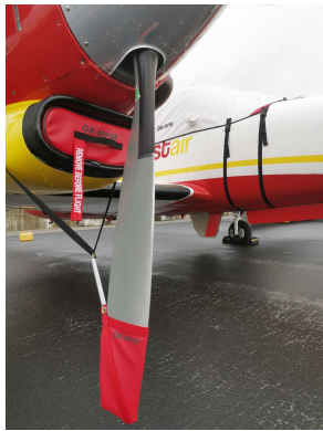
Piper PA-42 Cheyenne III Prop Tie/Exhaust Cover, Inlet Plugs

This cover type is made from Silver Acrylic Sunbrella canvas and is 100% lined with a soft and smooth microfiber. Bruce's Custom Covers developed this material combination especially for aircraft protection. The outer material is medium weight and treated for water resistance, UV resistance and anti-static buildup. The inner lining is a very soft and smooth microfiber to prevent scratching. The material is very reflective, and tests show that the cabin interior temperature can be reduced to near-ambient temperature on the hottest of days. It is water, ice and snow repellent, yet breathable to allow moisture to escape from between the cover and the aircraft surface.