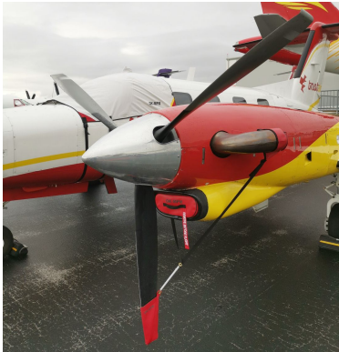
Piper PA-42 Cheyenne III Prop Tie/Exhaust Cover, Inlet Plugs

Engine Inlet Plugs are custom fit for your Piper PA-42 Cheyenne III intakes, made with heavy-duty vinyl material, and stuffed with a single block of sculpted urethane foam. Each plug has a zipper that allows the foam to be removed and dried if necessary. Engine plugs have warning flags that are visible from the cockpit or 'remove before flight' streamers sewn onto the face of the plugs. Most plugs are imprinted with the aircraft registration number in black for an extra charge. Storage bag NOT included. Engine plugs may be inserted after flight when the engine is still warm. Engine Inlet Plugs are commonly referred to as Cowl Plugs, Intake Plugs, Cowl Blocks, Engine Blocks, and Engine Bungs.