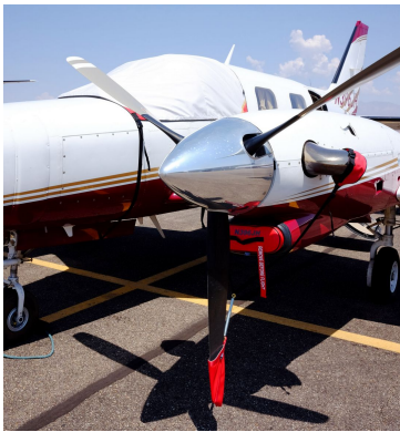
Piper Cheyenne Cockpit Cover, Engine Plugs, Prop Tie/Exhaust Covers

This cover type is made from Silver Acrylic Sunbrella canvas and is 100% lined with a soft and smooth microfiber. Bruce's Custom Covers developed this material combination especially for aircraft protection. The outer material is medium weight and treated for water resistance, UV resistance and anti-static buildup. The inner lining is a very soft and smooth microfiber to prevent scratching. The material is very reflective, and tests show that the cabin interior temperature can be reduced to near-ambient temperature on the hottest of days. It is water, ice and snow repellent, yet breathable to allow moisture to escape from between the cover and the aircraft surface.