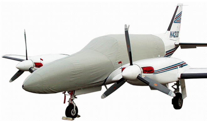
Piper Navajo CR Canopy/Nose Cover