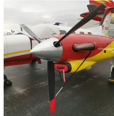
Piper PA-42 Cheyenne III Engine Plugs, Prop Ties, Cockpit Cover Piper PA-42 Cheyenne III Prop Tie/Exhaust Cover, Inlet Plugs