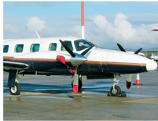
Piper Cheyenne IIXL Prop Tie/Exhaust Covers, Intake Plugs