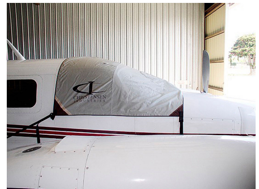
Piper Cheyenne Cockpit Cover