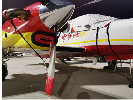
Piper PA-42 Cheyenne III Cockpit Cover, Prop Tie/Exhaust Cover, Inlet Plugs