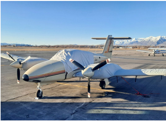
Piper PA-44 Wing/Engine Covers, Canopy Cover