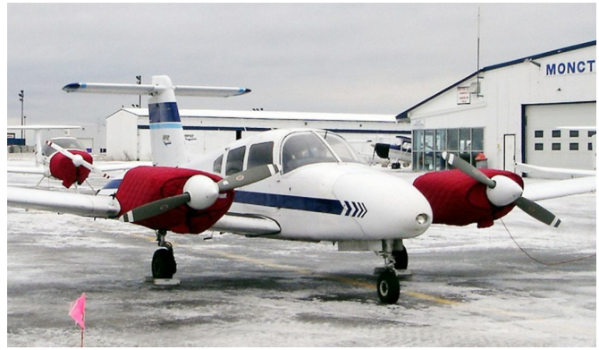
Piper Seminole Insulated Engine Covers