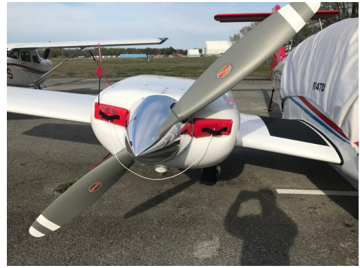
Piper Seminole Engine Plugs