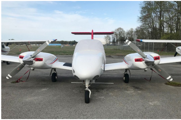
Piper Seminole Engine Plugs