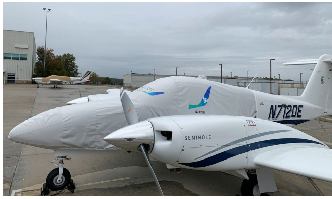
Piper PA-44 Seminole Canopy/Nose Cover with custom artwork