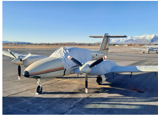
Piper PA-44 Wing/Engine Covers, Canopy Cover

WINTER USE MATERIAL - Made with Solution-Dyed Polyester fabric, this option is intended for seasonal use to aid in deicing, rain mitigation, or for occasional travel. The material is lighter and more compact, but more susceptible to UV damage and may have a shorter useful life if used continuously outside than the all-year use material.