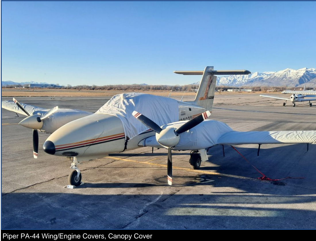
Piper PA-44 Wing/Engine Covers, Canopy Cover