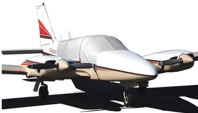
Piper Seneca PA-34 Canopy Cover

Travel Covers are made with Silver Solution-Dyed Polyester fabric and only lined over the windshield to save weight. The material is lightweight and more compact for easy stowage in the aircraft. The polyester material is water resistant, but only intended for occasional use outside. We also have an ultra lightweight material available for fitted hangar dust covers. For daily outdoor use, the non-travel Sunbrella Cover is the best choice.