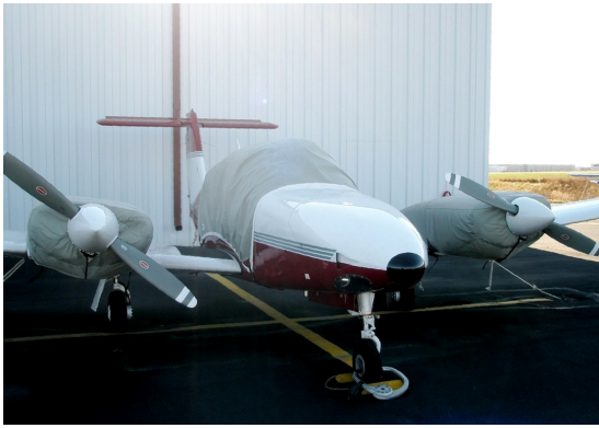
Piper Seminole Canopy and Engine Covers