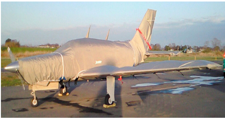
Piper PA-46 Malibu Complete Cover Set