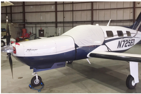
Piper Malibu/Mirage Cockpit Cover, Engine Plugs