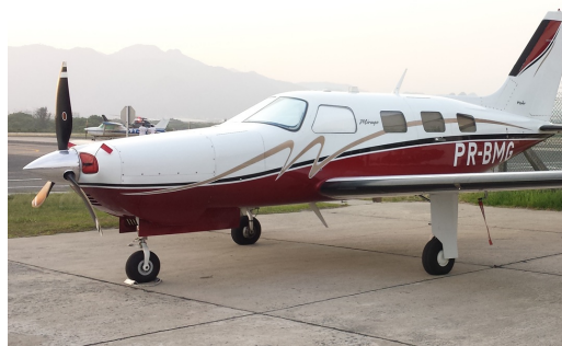
Piper Malibu/Mirage Engine Plugs, Cockpit HeatShields