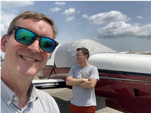
Piper Malibu/Mirage Cockpit Cover

This cover type is made from Silver Acrylic Sunbrella canvas and is 100% lined with a soft and smooth microfiber. Bruce's Custom Covers developed this material combination especially for aircraft protection. The outer material is medium weight and treated for water resistance, UV resistance and anti-static buildup. The inner lining is a very soft and smooth microfiber to prevent scratching. The material is very reflective, and tests show that the cabin interior temperature can be reduced to near-ambient temperature on the hottest of days. It is water, ice and snow repellent, yet breathable to allow moisture to escape from between the cover and the aircraft surface.