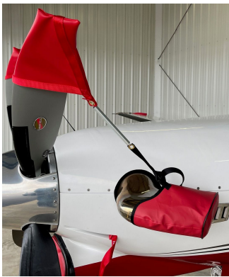
Piper Malibu JetProp Prop Tie & Exhaust Cover

This cover type is made from Silver Acrylic Sunbrella canvas and is 100% lined with a soft and smooth microfiber. Bruce's Custom Covers developed this material combination especially for aircraft protection. The outer material is medium weight and treated for water resistance, UV resistance and anti-static buildup. The inner lining is a very soft and smooth microfiber to prevent scratching. The material is very reflective, and tests show that the cabin interior temperature can be reduced to near-ambient temperature on the hottest of days. It is water, ice and snow repellent, yet breathable to allow moisture to escape from between the cover and the aircraft surface.