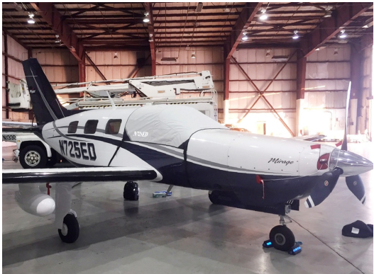
Piper Malibu/Mirage Cockpit Cover, Engine Plugs