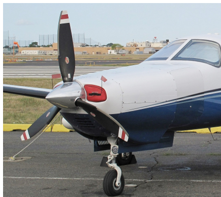
Piper Mirage Engine Plugs

Engine Inlet Plugs are custom fit for your Piper PA-46 Malibu intakes, made with heavy-duty vinyl material, and stuffed with a single block of sculpted urethane foam. Each plug has a zipper that allows the foam to be removed and dried if necessary. Engine plugs have warning flags that are visible from the cockpit or 'remove before flight' streamers sewn onto the face of the plugs. Most plugs are imprinted with the aircraft registration number in black for an extra charge. Storage bag NOT included. Engine plugs may be inserted after flight when the engine is still warm. Engine Inlet Plugs are commonly referred to as Cowl Plugs, Intake Plugs, Cowl Blocks, Engine Blocks, and Engine Bungs.