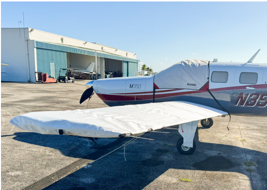
Piper PA 46-350P Cockpit & Wing Covers

WINTER USE MATERIAL - Made with Solution-Dyed Polyester fabric, this option is intended for seasonal use to aid in deicing, rain mitigation, or for occasional travel. The material is lighter and more compact, but more susceptible to UV damage and may have a shorter useful life if used continuously outside than the all-year use material.