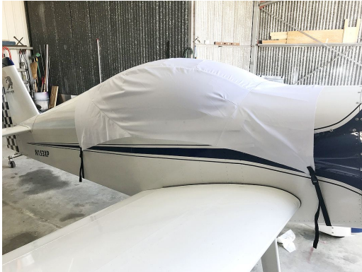
SPA, Sport Performance Aviation, Panther Canopy Cover (test fit cover)

This cover type is made from Silver Acrylic Sunbrella canvas and is 100% lined with a soft and smooth microfiber. Bruce's Custom Covers developed this material combination especially for aircraft protection. The outer material is medium weight and treated for water resistance, UV resistance and anti-static buildup. The inner lining is a very soft and smooth microfiber to prevent scratching. The material is very reflective, and tests show that the cabin interior temperature can be reduced to near-ambient temperature on the hottest of days. It is water, ice and snow repellent, yet breathable to allow moisture to escape from between the cover and the aircraft surface.