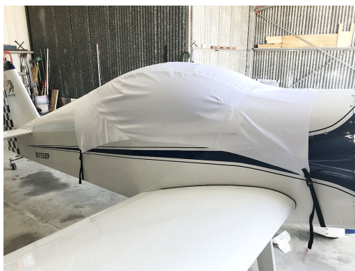
SPA, Sport Performance Aviation, Panther Canopy Cover (test fit cover)