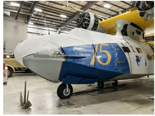
Vultee PBX Amphibian Cockpit/Nose Cover