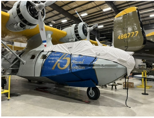
Consolidated Vultee PBX Amphibian Cockpit/Nose Cover