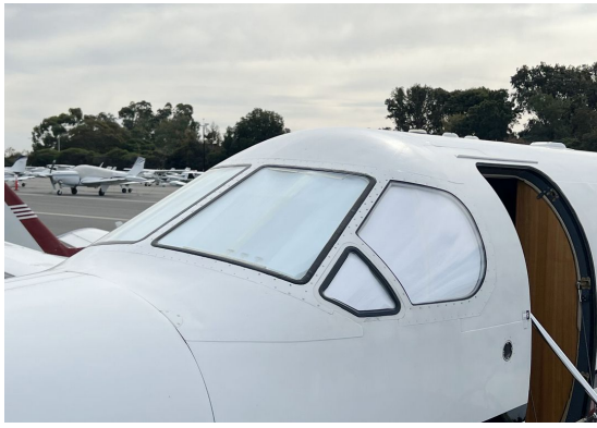
Pilatus PC-12 Cockpit HeatShields