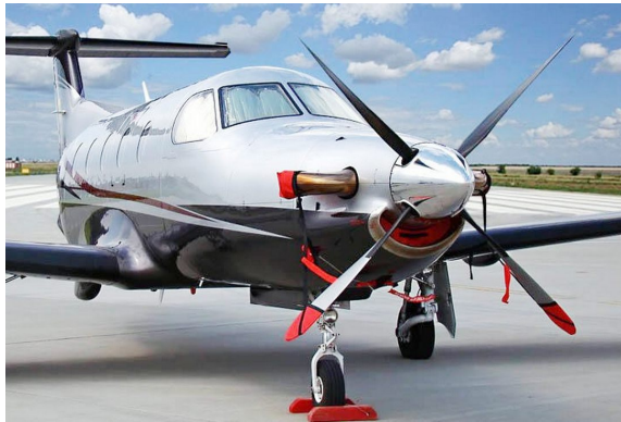
Pilatus PC-12 Engine Plugs, Prop Ties, Cockpit HeatShields

Cockpit Heatshields are interior sunshades for the aircraft's cockpit. The product is a unique composite of closed-cell foam with a silver mylar finish. The semi-rigid design is stiff enough to stand inside the window framing. The set folds up flat and is easily stored in the included storage sleeve. Some designs may require velcro and suction cups. A Heatshield is an excellent short-term remedy for cockpit overheating, but an external fabric cover is more effective for long-term protection.