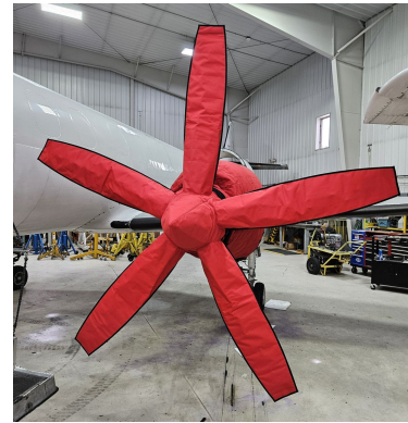
Main Intake Plug and Prop-Tie/Exhaust Covers. (Sold Separately)