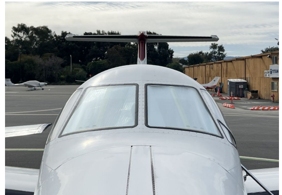
Pilatus PC-12 Cockpit HeatShields