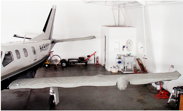
Socata TBM 700, 850 Wing and Horizontal Stabilizer Covers

WINTER USE MATERIAL - Made with Solution-Dyed Polyester fabric, this option is intended for seasonal use to aid in deicing, rain mitigation, or for occasional travel. The material is lighter and more compact, but more susceptible to UV damage and may have a shorter useful life if used continuously outside than the all-year use material.