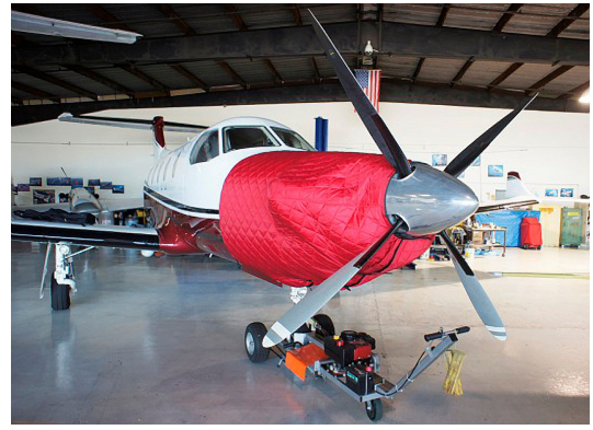
Pilatus PC-12 Insulated Engine Cover