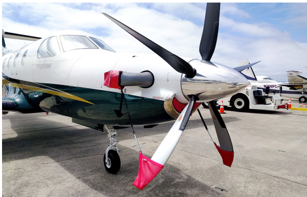
Main Intake Plug and Prop-Tie/Exhaust Covers. (Sold Separately)

Engine Inlet Plugs are custom fit for your Pilatus PC-12, U-28A, NGX intakes, made with heavy-duty vinyl material, and stuffed with a single block of sculpted urethane foam. Each plug has a zipper that allows the foam to be removed and dried if necessary. Engine plugs have warning flags that are visible from the cockpit or 'remove before flight' streamers sewn onto the face of the plugs. Most plugs are imprinted with the aircraft registration number in black for an extra charge. Storage bag NOT included. Engine plugs may be inserted after flight when the engine is still warm. Engine Inlet Plugs are commonly referred to as Cowl Plugs, Intake Plugs, Cowl Blocks, Engine Blocks, and Engine Bungs.