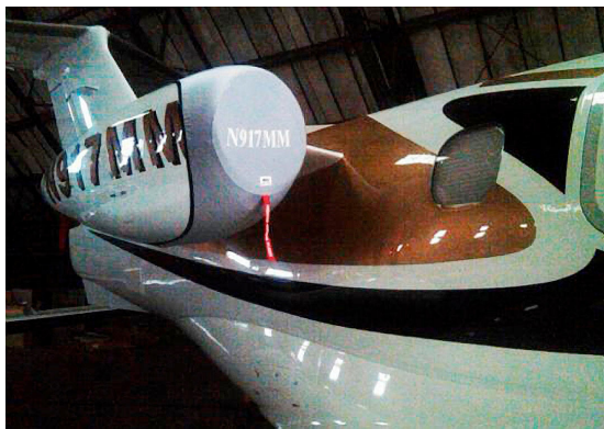
Phenom 100 Intake/Exhaust Cover, "Bikini" Type

The Pilatus PC-24 Intake/Exhaust Plugs are custom fit for the intake and exhaust openings, made with heavy-duty vinyl material, and stuffed with a single block of sculpted urethane foam. Each plug has a zipper that allows the foam to be removed and dried if necessary. Engine plugs have 'remove before flight' streamers sewn onto the face of the plugs. Most plugs are imprinted with the aircraft registration number in black. Engine plugs may be inserted after flight when the engine is still warm. Engine Inlet Plugs are commonly referred to as Cowl Plugs, Intake Plugs, Cowl Blocks, Engine Blocks, and Engine Bungs.