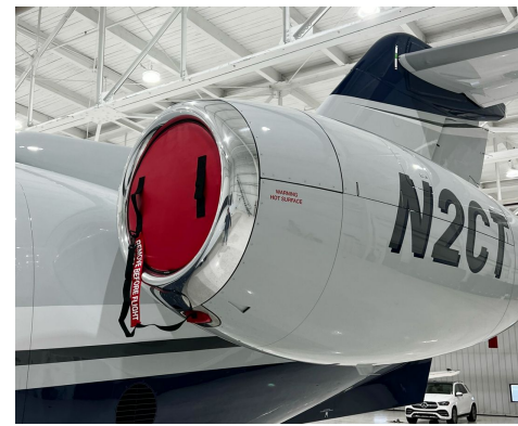
Pilatus PC-24 Engine Inlet Plugs