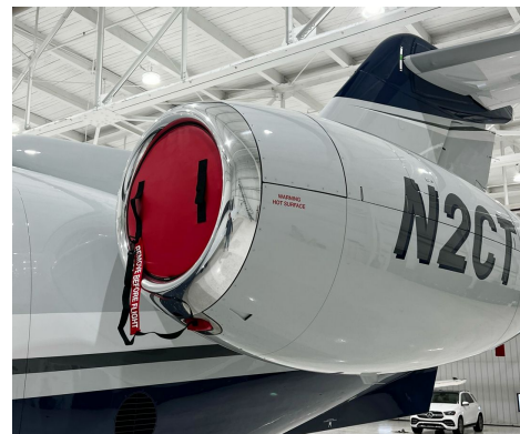
Pilatus PC-24 Engine Inlet Plugs