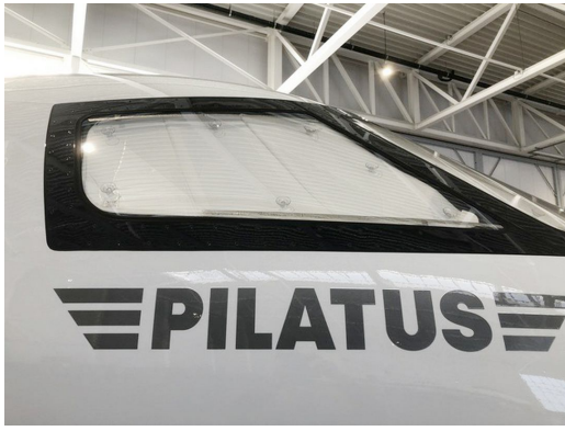
Pilatus PC-24 Cockpit HeatShields