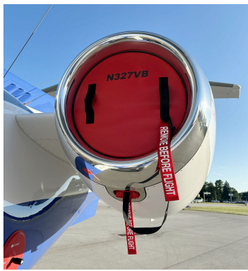
Pilatus PC-24 Engine Inlet Plugs & Exhaust Plugs, With Starter Inlet Plugs

The Engine Inlet Plugs are custom fit for your Pilatus PC-24 intakes, made with heavy-duty vinyl material, and stuffed with a single block of sculpted urethane foam. Each plug has a zipper that allows the foam to be removed and dried if necessary. Engine plugs have 'remove before flight' streamers sewn onto the face of the plugs. Most plugs are imprinted with the aircraft registration number in black for an extra charge. Storage bag NOT included. Engine plugs may be inserted after flight when the engine is still warm. Engine Inlet Plugs are commonly referred to as Cowl Plugs, Intake Plugs, Cowl Blocks, Engine Blocks, and Engine Bungs.