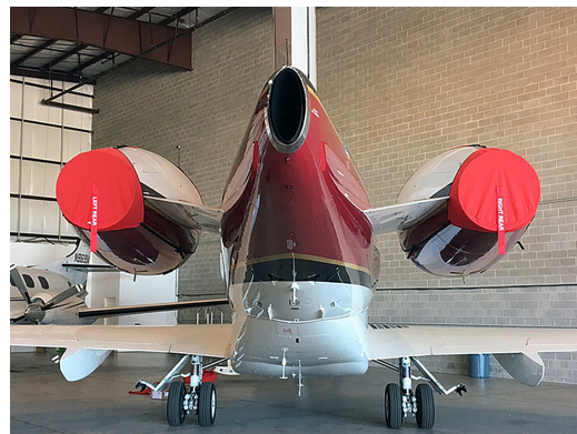
Canadair Challenger 300 Intake/Exhaust Covers, 3-Strap Type