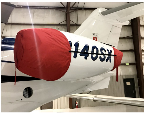
Pilatus PC-24 Engine Cover Set, Tri-Fold Type

The Pilatus PC-24 Intake/Exhaust Plugs are custom fit for the intake and exhaust openings, made with heavy-duty vinyl material, and stuffed with a single block of sculpted urethane foam. Each plug has a zipper that allows the foam to be removed and dried if necessary. Engine plugs have 'remove before flight' streamers sewn onto the face of the plugs. Most plugs are imprinted with the aircraft registration number in black. Engine plugs may be inserted after flight when the engine is still warm. Engine Inlet Plugs are commonly referred to as Cowl Plugs, Intake Plugs, Cowl Blocks, Engine Blocks, and Engine Bunges.