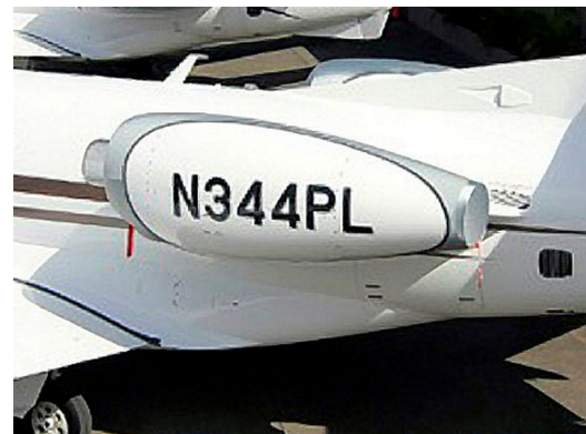
Phenom 300 "Bikini" type Engine Cover