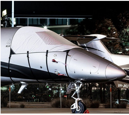
Pilatus PC-24 Cockpit Cover