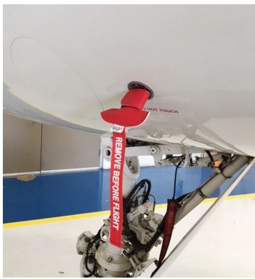
Grumman Gulfstream G-V Rosemont/TAT Cover

The Engine Inlet Plugs are custom fit for your Pilatus PC-24 intakes, made with heavy-duty vinyl material, and stuffed with a single block of sculpted urethane foam. Each plug has a zipper that allows the foam to be removed and dried if necessary. Engine plugs have 'remove before flight' streamers sewn onto the face of the plugs. Most plugs are imprinted with the aircraft registration number in black for an extra charge. Storage bag NOT included. Engine plugs may be inserted after flight when the engine is still warm. Engine Inlet Plugs are commonly referred to as Cowl Plugs, Intake Plugs, Cowl Blocks, Engine Blocks, and Engine Bungs.