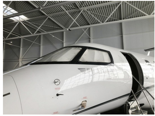
Pilatus PC-24 Cockpit HeatShields