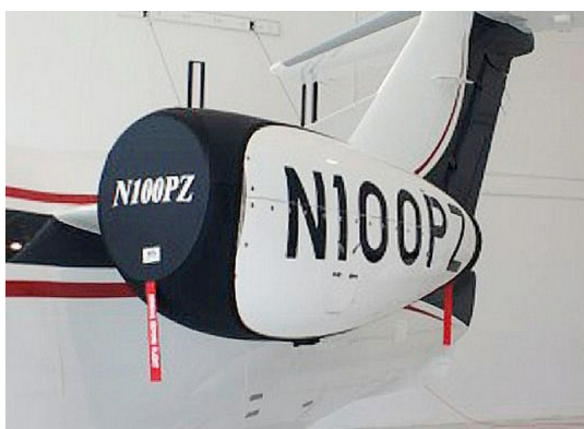
Phenom 100 "Bikini" Engine Covers

The Pilatus PC-24 Intake/Exhaust Plugs are custom fit for the intake and exhaust openings, made with heavy-duty vinyl material, and stuffed with a single block of sculpted urethane foam. Each plug has a zipper that allows the foam to be removed and dried if necessary. Engine plugs have 'remove before flight' streamers sewn onto the face of the plugs. Most plugs are imprinted with the aircraft registration number in black. Engine plugs may be inserted after flight when the engine is still warm. Engine Inlet Plugs are commonly referred to as Cowl Plugs, Intake Plugs, Cowl Blocks, Engine Blocks, and Engine Bungs.