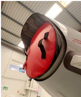
Pilatus PC-24 Engine Exhaust Plug

The Pilatus PC-24 Intake/Exhaust Plugs are custom fit for the intake and exhaust openings, made with heavy-duty vinyl material, and stuffed with a single block of sculpted urethane foam. Each plug has a zipper that allows the foam to be removed and dried if necessary. Engine plugs have 'remove before flight' streamers sewn onto the face of the plugs. Most plugs are imprinted with the aircraft registration number in black. Engine plugs may be inserted after flight when the engine is still warm. Engine Inlet Plugs are commonly referred to as Cowl Plugs, Intake Plugs, Cowl Blocks, Engine Blocks, and Engine Bung.