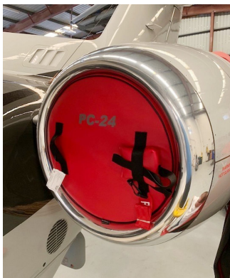
Pilatus PC-24 Engine Intake Plug

The Engine Inlet Plugs are custom fit for your Pilatus PC-24 intakes, made with heavy-duty vinyl material, and stuffed with a single block of sculpted urethane foam. Each plug has a zipper that allows the foam to be removed and dried if necessary. Engine plugs have 'remove before flight' streamers sewn onto the face of the plugs. Most plugs are imprinted with the aircraft registration number in black for an extra charge. Storage bag NOT included. Engine plugs may be inserted after flight when the engine is still warm. Engine Inlet Plugs are commonly referred to as Cowl Plugs, Intake Plugs, Cowl Blocks, Engine Blocks, and Engine Bungs.