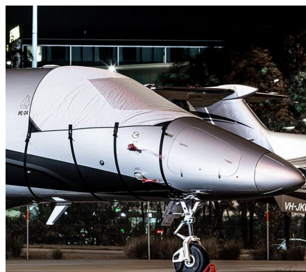
Pilatus PC-24 Cockpit Cover