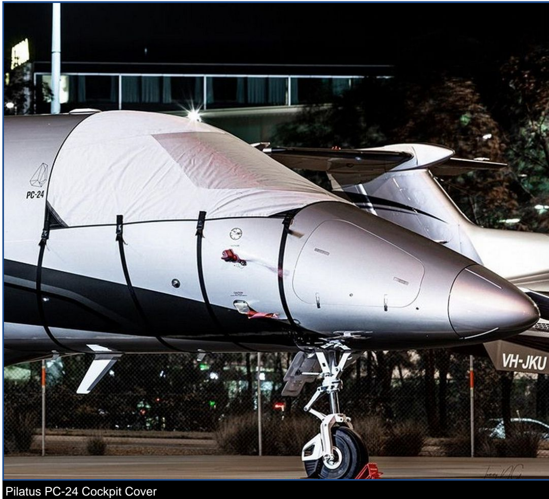
Pilatus PC-24 Cockpit Cover