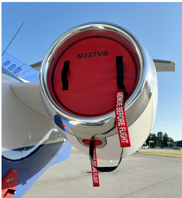
Grumman Gulfstream G-V Rosemont/TAT Cover Pilatus PC-24 Engine Inlet Plugs & Exhaust Plugs, With Starter Inlet Plugs