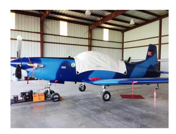
Pilatus PC-7 Canopy Cover

Travel Covers are made with Silver Solution-Dyed Polyester fabric and only lined over the windshield to save weight. The material is lightweight and more compact for easy stowage in the aircraft. The polyester material is water resistant, but only intended for occasional use outside. We also have an ultra lightweight material available for fitted hangar dust covers. For daily outdoor use, the non-travel Sunbrella Cover is the best choice.