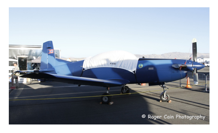
Pilatus PC-7 Canopy Cover