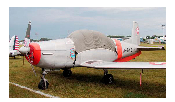
Pilatus P-3 Canopy Cover