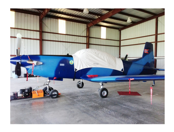
Pilatus PC-7 Canopy Cover

This cover type is made from Silver Acrylic Sunbrella canvas and is 100% lined with a soft and smooth microfiber. Bruce's Custom Covers developed this material combination especially for aircraft protection. The outer material is medium weight and treated for water resistance, UV resistance and anti-static buildup. The inner lining is a very soft and smooth microfiber to prevent scratching. The material is very reflective, and tests show that the cabin interior temperature can be reduced to near-ambient temperature on the hottest of days. It is water, ice and snow repellent, yet breathable to allow moisture to escape from between the cover and the aircraft surface.