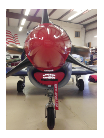
Pilatus PC7 Engine Inlet Plug