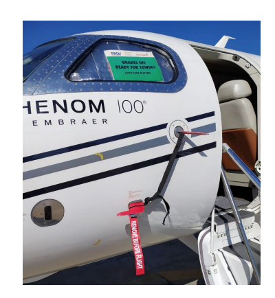
Phenom 100 (EMB 500) Pitot Cover/AOA Set

The Engine Inlet Plugs are custom fit for your Embraer Phenom 100 (EMB-500) intakes, made with heavy-duty vinyl material, and stuffed with a single block of sculpted urethane foam. Each plug has a zipper that allows the foam to be removed and dried if necessary. Engine plugs have 'remove before flight' streamers sewn onto the face of the plugs. Most plugs are imprinted with the aircraft registration number in black for an extra charge. Storage bag NOT included. Engine plugs may be inserted after flight when the engine is still warm. Engine Inlet Plugs are commonly referred to as Cowl Plugs, Intake Plugs, Cowl Blocks, Engine Blocks, and Engine Bungs.