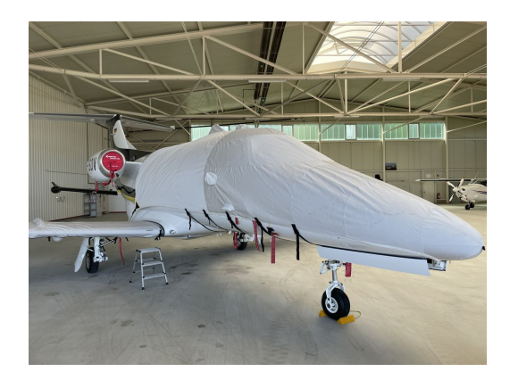
Phenom 100 EMB-500 Cockpit Cover (includes straps to hook around traffic antennae so the cover will not slip forward)