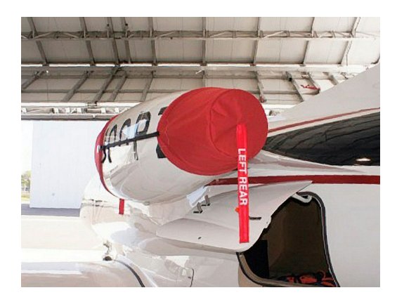
Phenom 100 Tri-fold style Engine Cover Set

Phenom 100 Intake/Exhaust Cover, "Bikini" Type