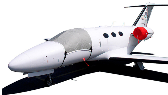
Citation Mustang Windshield Cover, Intake Cover/Exhaust Plug Set, Pitot Covers

This cover type is made from Silver Acrylic Sunbrella canvas and is 100% lined with a soft and smooth microfiber. Bruce's Custom Covers developed this material combination especially for aircraft protection. The outer material is medium weight and treated for water resistance, UV resistance and anti-static buildup. The inner lining is a very soft and smooth microfiber to prevent scratching. The material is very reflective, and tests show that the cabin interior temperature can be reduced to near-ambient temperature on the hottest of days. It is water, ice and snow repellent, yet breathable to allow moisture to escape from between the cover and the aircraft surface.