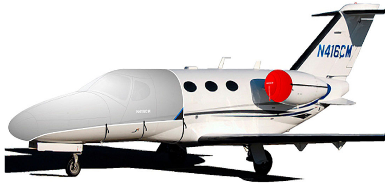
Citation Mustang Cockpit/Door/Nose Cover, Engine Inlet Cover