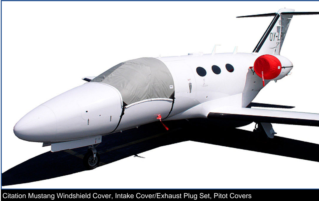
Citation Mustang Windshield Cover, Intake Cover/Exhaust Plug Set, Pitot Covers