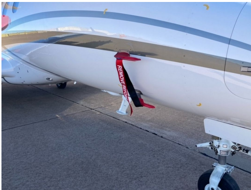
Embraer Phenom 300 (EMB-505) Heat Resistant Pitot Covers

the engine is still warm. Engine Inlet Plugs are commonly referred to as Cowl Plugs, Intake Plugs, Cowl Blocks, Engine Blocks, and Engine Bung.