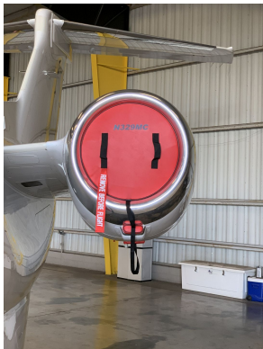
Embraer Phenom 300 Intake Plugs