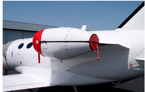
Cessna Mustang Intake/Exhaust Plug Set