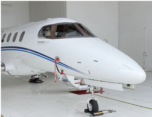
Embraer EMB-505 Pitot Cover Set

The Engine Inlet Plugs are custom fit for your Embraer Phenom 300 (EMB-505) intakes, made with heavy-duty vinyl material, and stuffed with a single block of sculpted urethane foam. Each plug has a zipper that allows the foam to be removed and dried if necessary. Engine plugs have 'remove before flight' streamers sewn onto the face of the plugs. Most plugs are imprinted with the aircraft registration number in black for an extra charge. Storage bag NOT included. Engine plugs may be inserted after flight when the engine is still warm. Engine Inlet Plugs are commonly referred to as Cowl Plugs, Intake Plugs, Cowl Blocks, Engine Blocks, and Engine Bungs.