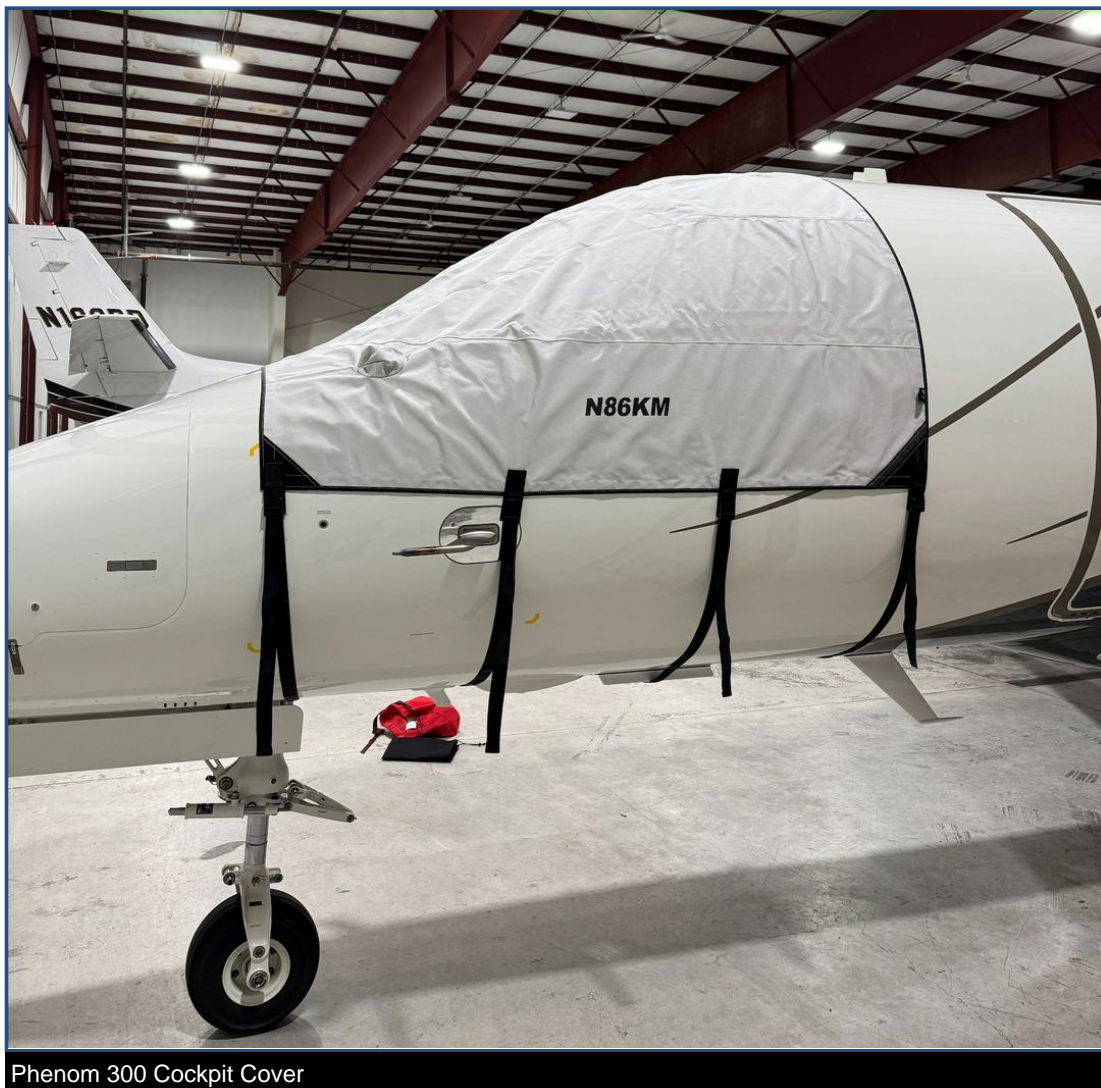
Phenom 300 Cockpit Cover