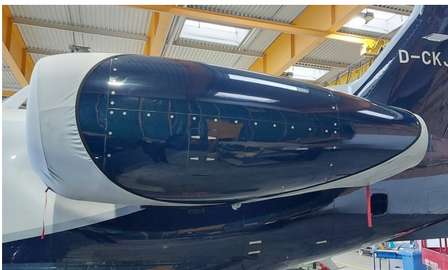
Phenom 300 Bikini Type Engine Cover

The Embraer Phenom 300 (EMB-505) Intake/Exhaust Plugs are custom fit for the intake and exhaust openings, made with heavy-duty vinyl material, and stuffed with a single block of sculpted urethane foam. Each plug has a zipper that allows the foam to be removed and dried if necessary. Engine plugs have 'remove before flight' streamers sewn onto the face of the plugs. Most plugs are imprinted with the aircraft registration number in black. Engine plugs may be inserted after flight when the engine is still warm. Engine Inlet Plugs are commonly referred to as Cowl Plugs, Intake Plugs, Cowl Blocks, Engine Blocks, and Engine Bungs.