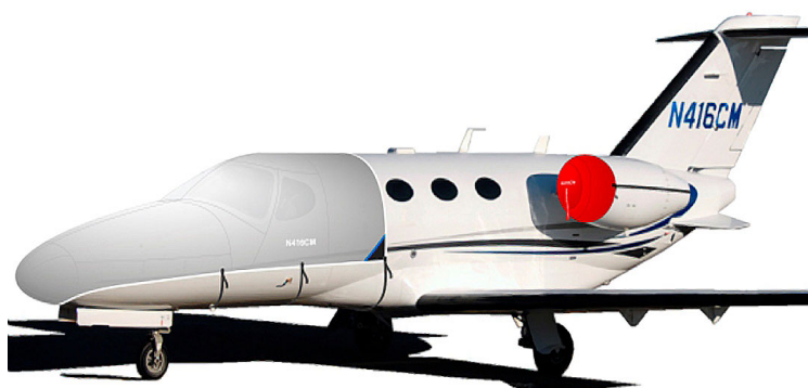
Citation Mustang Cockpit/Door/Nose Cover, Engine Inlet Cover