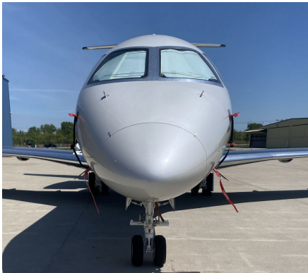
Embraer 505 Phenom 300 Cockpit HeatShields

Cockpit Heatshields are interior sunshades for the aircraft's cockpit. The product is a unique composite of closed-cell foam with a silver mylar finish. The semi-rigid design is stiff enough to stand inside the window framing. The set folds up flat and is easily stored in the included storage sleeve. Some designs may require velcro and suction cups. Our Heatshields for jets are offered white side out because some aircraft manufacturers have issued advisories against reflective window inserts due to potential heat damage. A Heatshield is an excellent short-term remedy for cockpit overheating, but an external fabric cover is more effective for long-term protection.