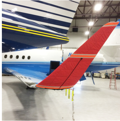
Falcon 2000 Winglet Pad