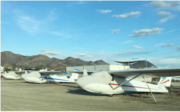
Schweizer SGS 2-33 Canopy/Nose Covers

the hottest of days. It is water, ice and snow repellent, yet breathable to allow moisture to escape from between the cover and the aircraft surface.