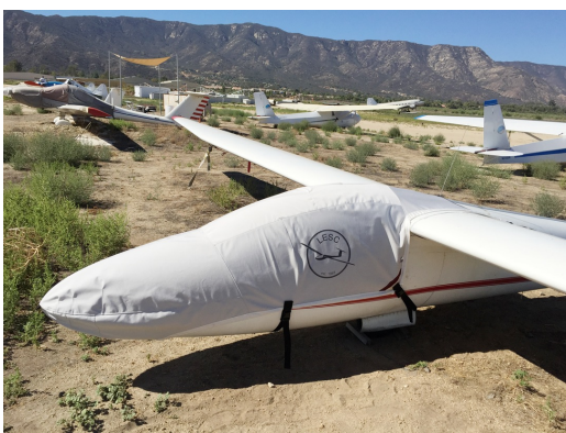
Pilatus B4 Canopy/Nose Cover