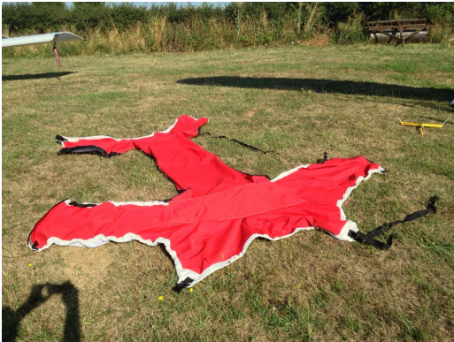
Porterfield Collegiate Canopy Cover