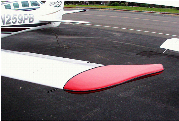
Cirrus SR-22 Wingtip Pad (also available for the Horiz. Stab.