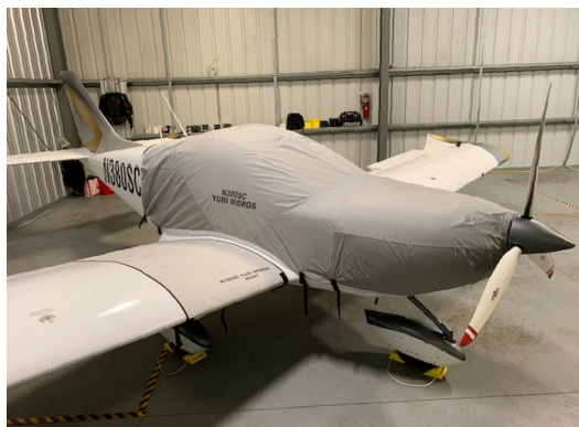
Czech Sport Travel Light Weight Canopy/Engine Cover, Wing Locker Covers

Travel Covers are made with Silver Solution-Dyed Polyester fabric and only lined over the windshield to save weight. The material is lightweight and more compact for easy stowage in the aircraft. The polyester material is water resistant, but only intended for occasional use outside. We also have an ultra lightweight material available for fitted hangar dust covers. For daily outdoor use, the non-travel Sunbrella Cover is the best choice.