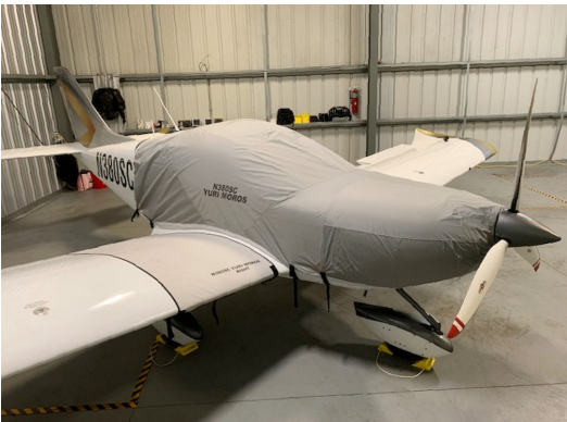
Czech Sport Travel Light Weight Canopy/Engine Cover, Wing Locker Covers