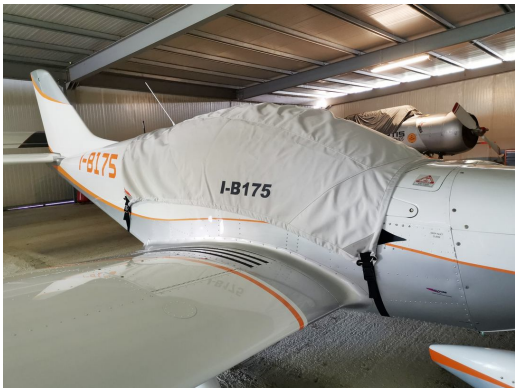
CZAW Sportcruiser Canopy Cover

This cover type is made from Silver Acrylic Sunbrella canvas and is 100% lined with a soft and smooth microfiber. Bruce's Custom Covers developed this material combination especially for aircraft protection. The outer material is medium weight and treated for water resistance, UV resistance and anti-static buildup. The inner lining is a very soft and smooth microfiber to prevent scratching. The material is very reflective, and tests show that the cabin interior temperature can be reduced to near-ambient temperature on the hottest of days. It is water, ice and snow repellent, yet breathable to allow moisture to escape from between the cover and the aircraft surface.