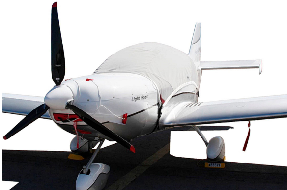
Sportcruiser Canopy Cover & Plugs