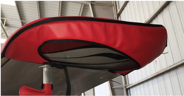
Cirrus SR-20/22 Wingtip Pads

Designed to prevent damage to the aircraft extremities in crowded hangars, these products are made of bright red Naugahyde and thickly padded with a sandwich of closed cell foam.