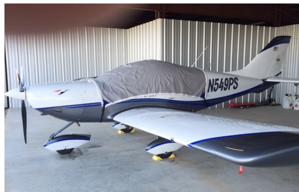
PiperSport Light Weight Travel Cover