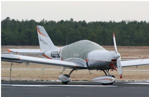
Czech Sport Cruiser Canopy Cover