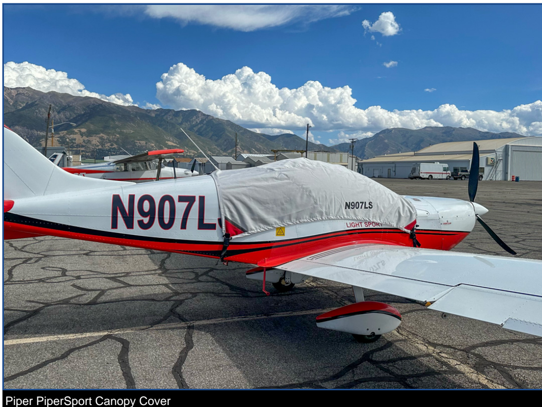
Piper PiperSport Canopy Cover