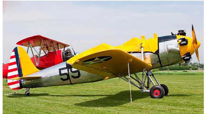
The Ryan PT-22 Canopy Cover