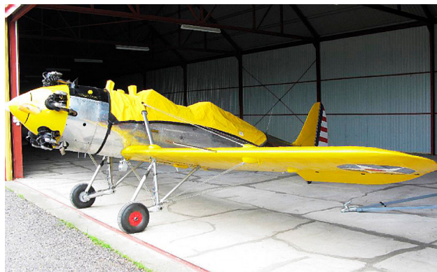
Ryan PT22 Canopy Cover