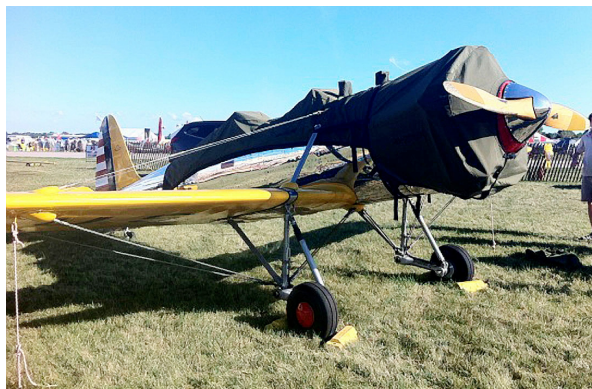
Ryan PT-22 Canopy Cover and Engine Cover

This cover type is made from Silver Acrylic Sunbrella canvas and is 100% lined with a soft and smooth microfiber. Bruce's Custom Covers developed this material combination especially for aircraft protection. The outer material is medium weight and treated for water resistance, UV resistance and anti-static buildup. The inner lining is a very soft and smooth microfiber to prevent scratching. The material is very reflective, and tests show that the cabin interior temperature can be reduced to near-ambient temperature on the hottest of days. It is water, ice and snow repellent, yet breathable to allow moisture to escape from between the cover and the aircraft surface.