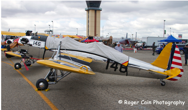
Ryan PT-22 Canopy Cover

This cover type is made from Silver Acrylic Sunbrella canvas and is 100% lined with a soft and smooth microfiber. Bruce's Custom Covers developed this material combination especially for aircraft protection. The outer material is medium weight and treated for water resistance, UV resistance and anti-static buildup. The inner lining is a very soft and smooth microfiber to prevent scratching. The material is very reflective, and tests show that the cabin interior temperature can be reduced to near-ambient temperature on the hottest of days. It is water, ice and snow repellent, yet breathable to allow moisture to escape from between the cover and the aircraft surface.