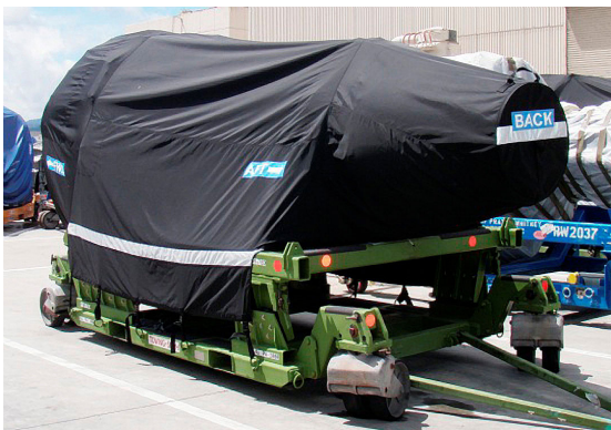
PW 2000 SERIES OFF-LINK ENGINE COVER, "rain cap" style