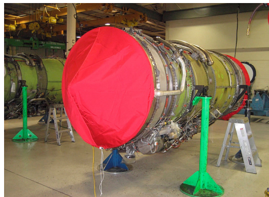
PW JT8D Off-Link Engine Shower Cap Cover Set