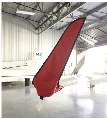
Schleicher ASH Wingtip Pads