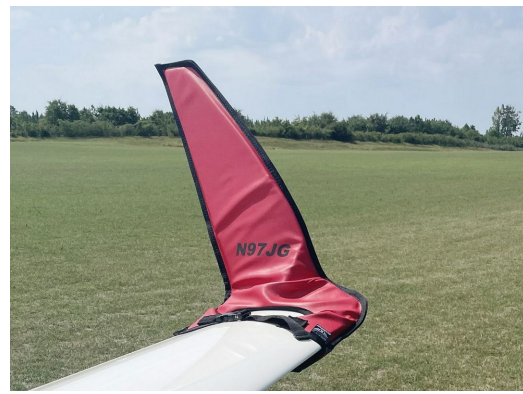
Schempp-Hirth Ventus-2B winglet/wingtip pads