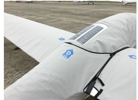
DG-505 Full Cover Set