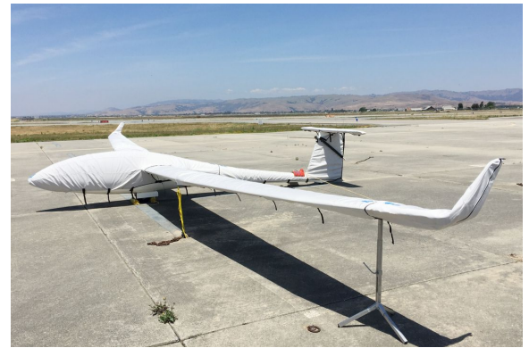
Schempp-Hirth Discus 2B Full Cover Set