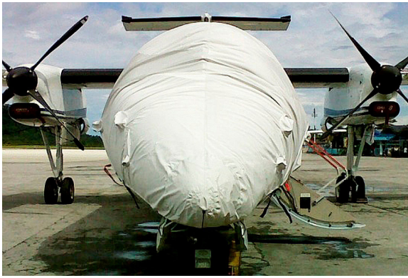
De Havilland Dash 8 Cockpit/Nose Cover