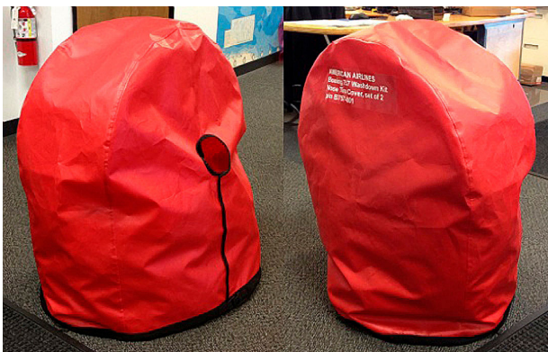
Boeing 757 Tire Covers, great for Wash Prep or Storage

ALL-YEAR USE MATERIAL - Made with Silver Acrylic Sunbrella canvas, the all-year use material is the best option for sun protection and cover longevity. This heavier more durable material is intended for all weather conditions, such as rain and snow or lots of sun.