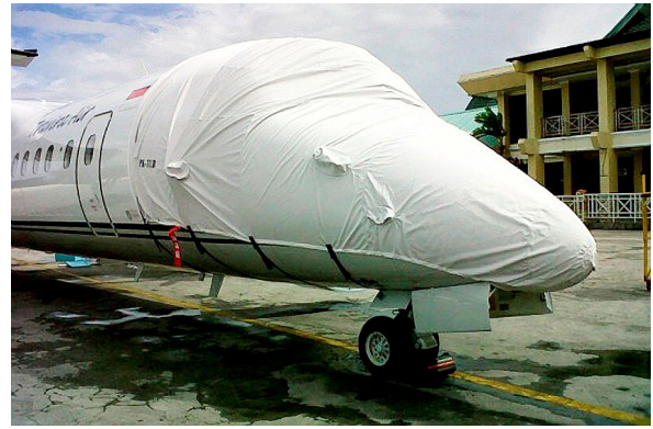
De Havilland Dash 8 Cockpit/Nose Cover