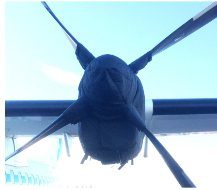
ATR-72-202 Insulated Engine & Prop Hub Covers