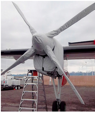
Dash 8 Insulated Engine & Prop Covers