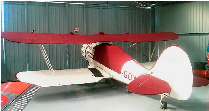
Waco UPF-7 Upper/Lower Wing Cover, Horizontal Stabilizer Cover, & Canopy Cover