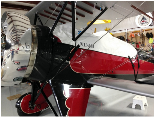
Waco QCF/UBF Canopy Cover