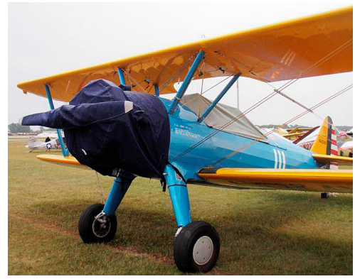
Stearman PT-13 Engine Cover