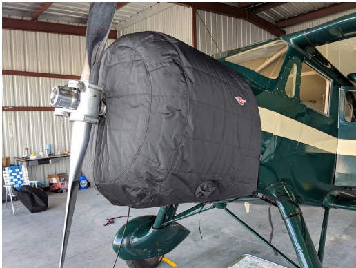
Wacon Cabin Biplane ZQC-6 Insulated Engine Cover