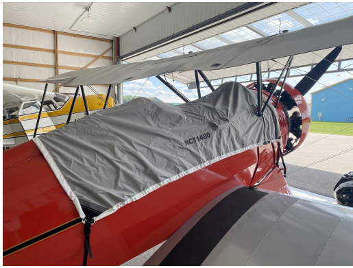
Waco QCF-2 Travel Weight Canopy Cover