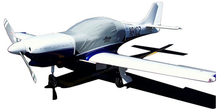
Canopy Cover for Lancair 320/360