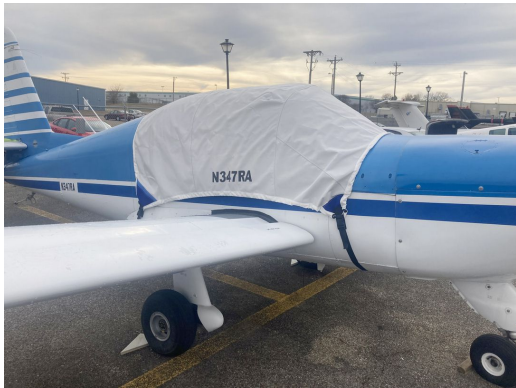
SOCATA Rallye 150 Canopy Cover

The Aerospatiale (Socata) Rallye 150 Canopy/Engine Cover is a one-piece cover (100% lined with microfiber) that is a combination of the Canopy Cover and Engine Cover. This cover will enclose the engine cowl and will extend aft to cover all of the windows. This cover type is made from Silver Acrylic Sunbrella canvas and is 100% lined with a soft and smooth microfiber. Bruce's Custom Covers developed this material combination especially for aircraft protection. The outer material is medium weight and treated for water resistance, UV resistance and anti-static buildup. The inner lining is a very soft and smooth microfiber to prevent scratching. The material is very reflective, and tests show that the cabin interior temperature can be reduced to near-ambient temperature on the hottest of days. It is water, ice and snow repellent, yet breathable to allow moisture to escape from between the cover and the aircraft surface.