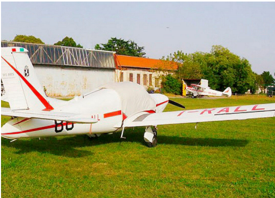
Standard Canopy Cover for MS893A