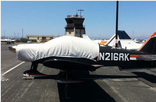
Robin Canopy/Engine Cover