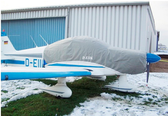
Robin R.2160 Canopy/Engine Cover

The Robin DR200 & related Canopy/Engine Cover is a one-piece cover (100% lined with microfiber) that is a combination of the Canopy Cover and Engine Cover. This cover will enclose the engine cowl and will extend aft to cover all of the windows. This cover type is made from Silver Acrylic Sunbrella canvas and is 100% lined with a soft and smooth microfiber. Bruce's Custom Covers developed this material combination especially for aircraft protection. The outer material is medium weight and treated for water resistance, UV resistance and anti-static buildup. The inner lining is a very soft and smooth microfiber to prevent scratching. The material is very reflective, and tests show that the cabin interior temperature can be reduced to near-ambient temperature on the hottest of days. It is water, ice and snow repellent, yet breathable to allow moisture to escape from between the cover and the aircraft surface.