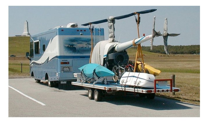
Robinson R-22 Bubble, Rotor Mast, Blades, Tail Rotor & Stabilizer Covers