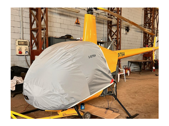
Robinson R-22 Travel Cover, Light Weight Travel Bubble Cover