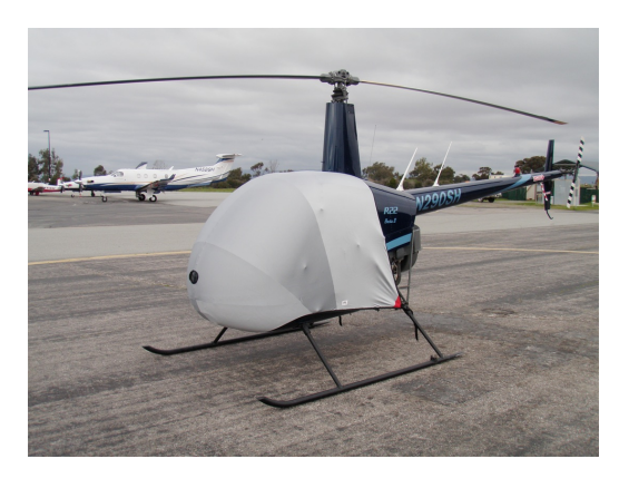
Robinson R-22 Light Weight Travel Cover