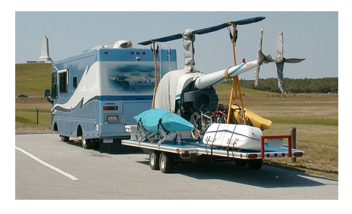
Robinson R-22 Bubble, Rotor Mast, Blades, Tail Rotor & Stabilizer Covers