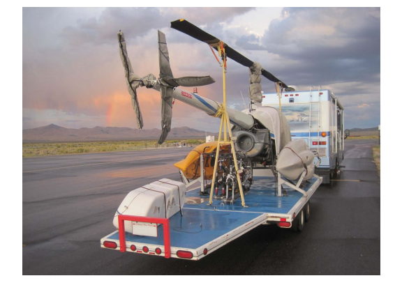
Robinson R-22 Bubble Cover (Ext. Past Rotor Hub), Engine Cover, Tailboom Cover, Blade Covers, Rotor Hub Cover, & Tail Rotor Gear Box Cover