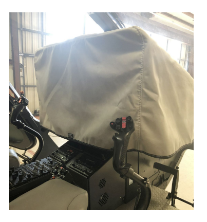
Eurocopter EC-135 Instrument Panel Heatshield Cover