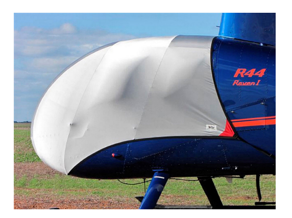
Robinson R-44 Light Weight Travel Cover

Travel Covers are made with Silver Solution-Dyed Polyester fabric and fully lined over the entire cover. The material is lightweight and more compact for easy stowage in the aircraft. The polyester material is water resistant, but only intended for occasional use outside. We also have an ultra lightweight material available for fitted hangar dust covers. For daily outdoor use, the non-travel Sunbrella Cover is the best choice.