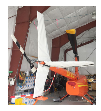
Robinson R-44/66 Horizontal & Vertical Stabilizer Covers

The Tailboom Cover details vary by model, but generally the helicopter tail boom cover encloses the tail boom from the "bottleneck" to the aft end. They usually also cover the horizontal stabilizers, and are custom made to allow for antennae, lights, and other protrusions. They attach with straps underneath the tail boom. Covers for the vertical and horizontal stabilizers are also available separately. Specific information for each model is available on request.