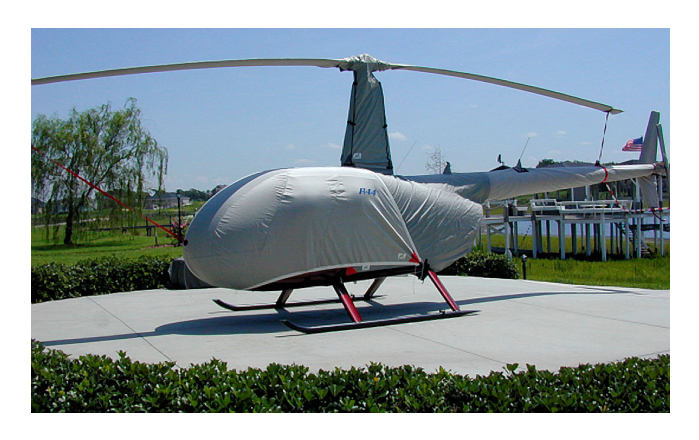
Robinson R-44 Full Cover Set