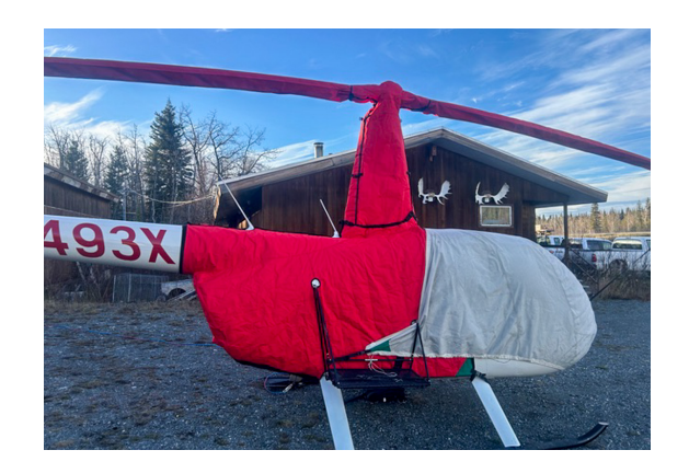
Robinson R-44 Bubble, Insulated Engine, Rotor Mast & Blade Covers