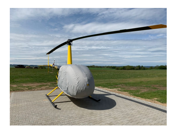
Robinson R-44 RAVEN I TRAVEL COVER