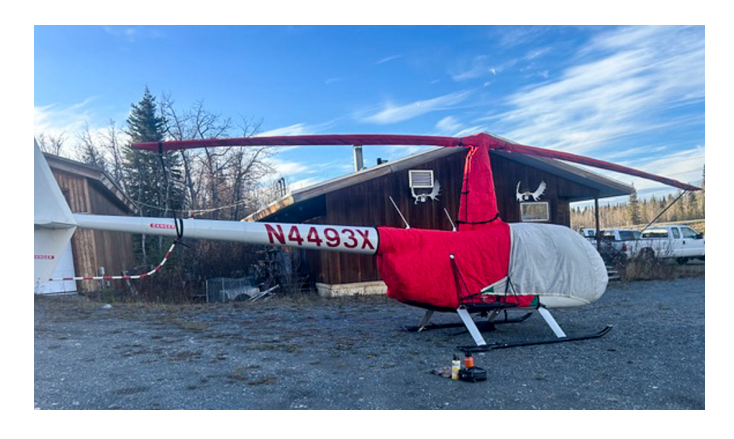
Robinson R-44 Bubble, Insulated Engine, Rotor Mast & Blade Covers