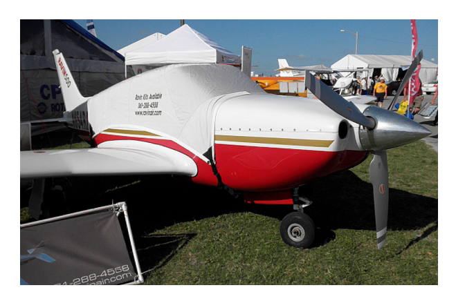
Ravin 500 Canopy Cover

This cover type is made from Silver Acrylic Sunbrella canvas and is 100% lined with a soft and smooth microfiber. Bruce's Custom Covers developed this material combination especially for aircraft protection. The outer material is medium weight and treated for water resistance, UV resistance and anti-static buildup. The inner lining is a very soft and smooth microfiber to prevent scratching. The material is very reflective, and tests show that the cabin interior temperature can be reduced to near-ambient temperature on the hottest of days. It is water, ice and snow repellent, yet breathable to allow moisture to escape from between the cover and the aircraft surface.