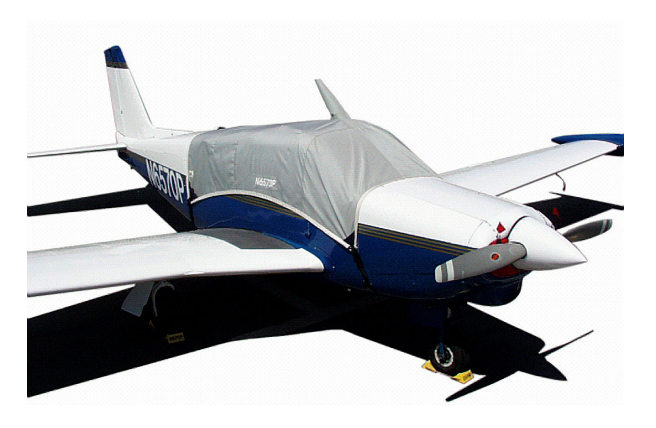
Piper Comanche Standard Canopy Cover & Engine Plugs