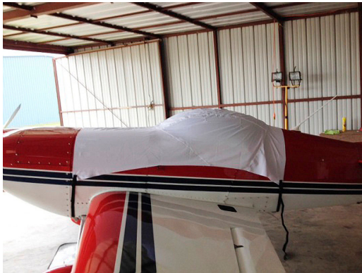
IAC One Design Canopy Cover, test fit cover

This cover type is made from Silver Acrylic Sunbrella canvas and is 100% lined with a soft and smooth microfiber. Bruce's Custom Covers developed this material combination especially for aircraft protection. The outer material is medium weight and treated for water resistance, UV resistance and anti-static buildup. The inner lining is a very soft and smooth microfiber to prevent scratching. The material is very reflective, and tests show that the cabin interior temperature can be reduced to near-ambient temperature on the hottest of days. It is water, ice and snow repellent, yet breathable to allow moisture to escape from between the cover and the aircraft surface.