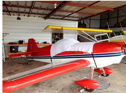
IAC One Design Canopy Cover, test fit cover