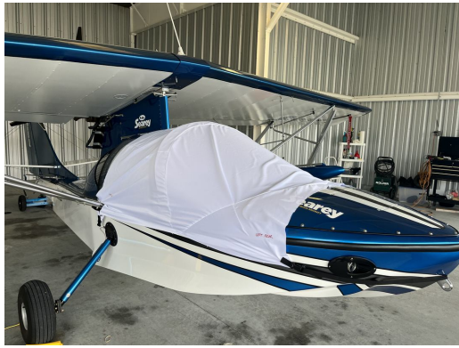
SeaRey Cockpit ONLY Cover, test fit cover