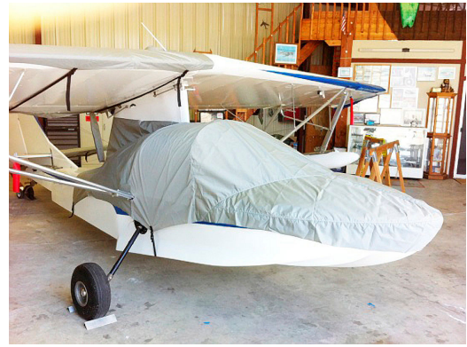
SeaRey Canopy Cover (test fit cover)