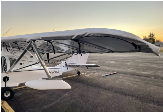
SeaRey Empennage & Wing Covers