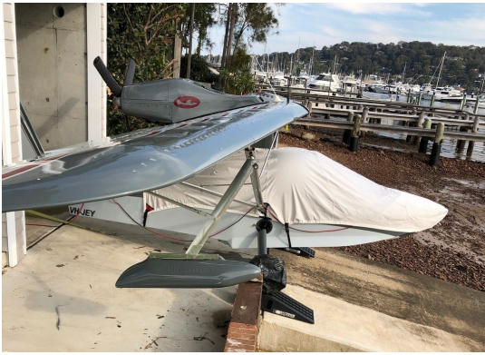
Searey Canopy/Nose Cover