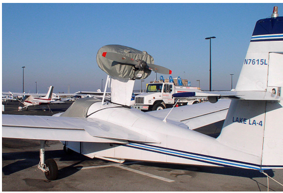
Lake Canopy & Engine Covers