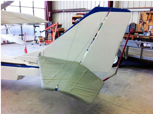
SeaRey Horizontal Stab. Cover (test fit cover)

Although these covers are bulky, they do help protect your wing and control surfaces against small to medium-size hail. ALL-YEAR USE MATERIAL - Made with Silver Acrylic Sunbrella canvas, the all-year use material is the best option for sun protection and cover longevity. This heavier more durable material is intended for all weather conditions, such as rain and snow or lots of sun. WINTER USE MATERIAL - Made with Solution-Dyed Polyester fabric, this option is intended for seasonal use to aid in deicing, rain mitigation, or for occasional travel. The material is lighter and more compact, but more susceptible to UV damage and may have a shorter useful life if used continuously outside than the all-year use material.