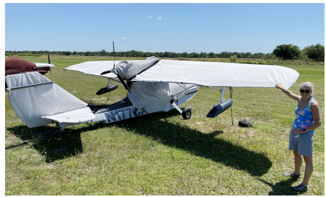
Searey Complete Cover Set