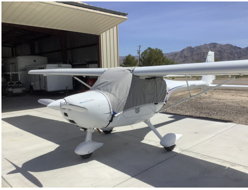
Remos G-3/600 Travel Cover