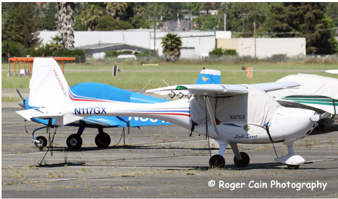
Remos GX Canopy Cover