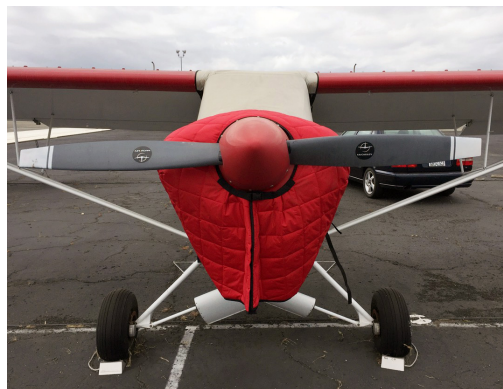
FOR INTERIOR USE. Cub Crafters CC-11 Insulated Hangar Blanket, available in Red or Silver