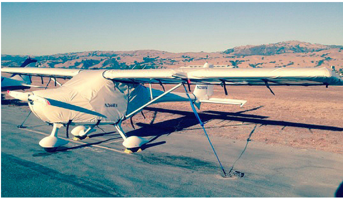
Remos Extended Canopy/Engine, Wing Covers

This cover type is made from Silver Acrylic Sunbrella canvas and is 100% lined with a soft and smooth microfiber. Bruce's Custom Covers developed this material combination especially for aircraft protection. The outer material is medium weight and treated for water resistance, UV resistance and anti-static buildup. The inner lining is a very soft and smooth microfiber to prevent scratching. The material is very reflective, and tests show that the cabin interior temperature can be reduced to near-ambient temperature on the hottest of days. It is water, ice and snow repellent, yet breathable to allow moisture to escape from between the cover and the aircraft surface.