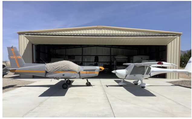
G-3/600 Travel Cover and Zlin 142 Canopy Cover