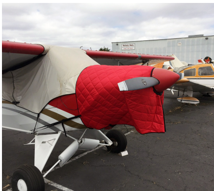
FOR INTERIOR USE. Cub Crafters CC-11 Insulated Hangar Blanket, available in Red or Silver

This cover type is made from Silver Acrylic Sunbrella canvas and is 100% lined with a soft and smooth microfiber. Bruce's Custom Covers developed this material combination especially for aircraft protection. The outer material is medium weight and treated for water resistance, UV resistance and anti-static buildup. The inner lining is a very soft and smooth microfiber to prevent scratching. The material is very reflective, and tests show that the cabin interior temperature can be reduced to near-ambient temperature on the hottest of days. It is water, ice and snow repellent, yet breathable to allow moisture to escape from between the cover and the aircraft surface.