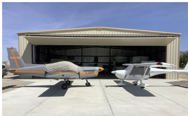
G-3/600 Travel Cover and Zlin 142 Canopy Cover