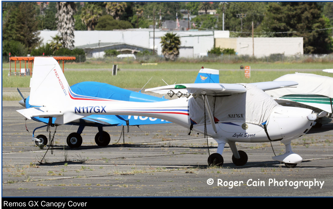
Remos GX Canopy Cover