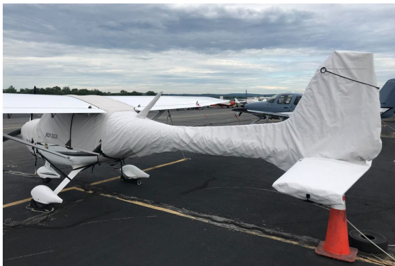
Remos G3 & GX MODELS Empennage Cover

WINTER USE MATERIAL - Made with Solution-Dyed Polyester fabric, this option is intended for seasonal use to aid in deicing, rain mitigation, or for occasional travel. The material is lighter and more compact, but more susceptible to UV damage and may have a shorter useful life if used continuously outside than the all-year use material.