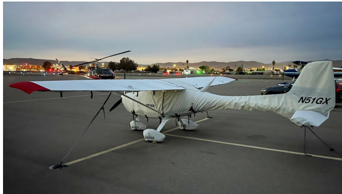
Remos RG-3 Complete Cover Set

ALL-YEAR USE MATERIAL - Made with Silver Acrylic Sunbrella canvas, the all-year use material is the best option for sun protection and cover longevity. This heavier more durable material is intended for all weather conditions, such as rain and snow or lots of sun.