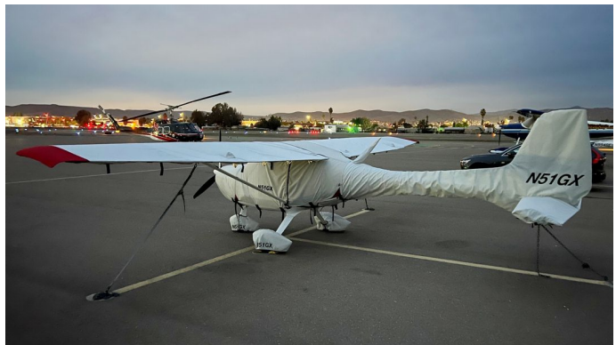
Remos RG-3 Complete Cover Set