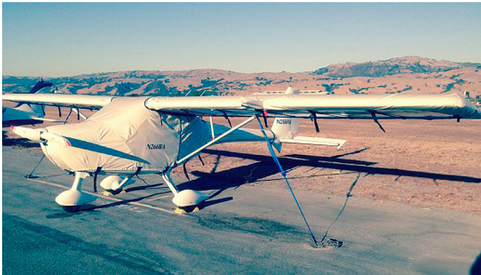
Remos Extended Canopy/Engine, Wing Covers

WINTER USE MATERIAL - Made with Solution-Dyed Polyester fabric, this option is intended for seasonal use to aid in deicing, rain mitigation, or for occasional travel. The material is lighter and more compact, but more susceptible to UV damage and may have a shorter useful life if used continuously outside than the all-year use material.