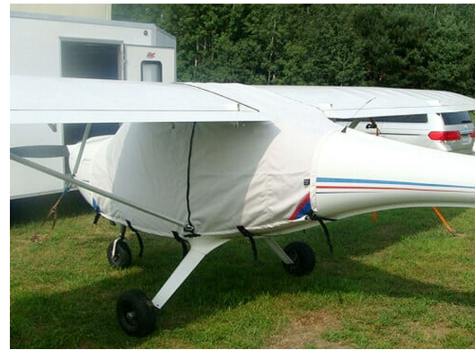
Remos G3 & GX MODELS Extended Canopy Cover (Over-The-Top Style)