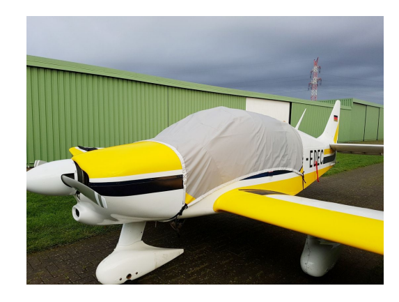
Robin DR400/R Travel Cover, Light Weight Travel Canopy Cover