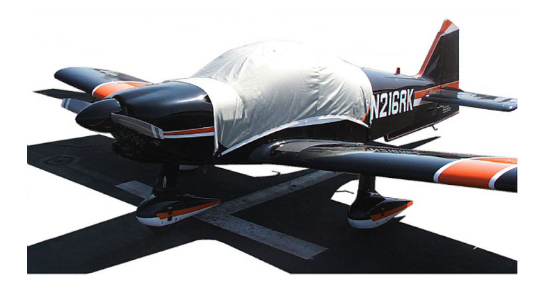
Robin R.2160 Canopy Cover