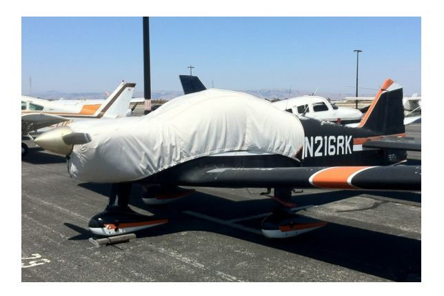
Robin Canopy/Engine Cover

This cover type is made from Silver Acrylic Sunbrella canvas and is 100% lined with a soft and smooth microfiber. Bruce's Custom Covers developed this material combination especially for aircraft protection. The outer material is medium weight and treated for water resistance, UV resistance and anti-static buildup. The inner lining is a very soft and smooth microfiber to prevent scratching. The material is very reflective, and tests show that the cabin interior temperature can be reduced to near-ambient temperature on the hottest of days. It is water, ice and snow repellent, yet breathable to allow moisture to escape from between the cover and the aircraft surface.