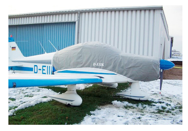
Robin R.2160 Canopy/Engine Cover

Travel Covers are made with Silver Solution-Dyed Polyester fabric and only lined over the windshield to save weight. The material is lightweight and more compact for easy stowage in the aircraft. The polyester material is water resistant, but only intended for occasional use outside. We also have an ultra lightweight material available for fitted hangar dust covers. For daily outdoor use, the non-travel Sunbrella Cover is the best choice.