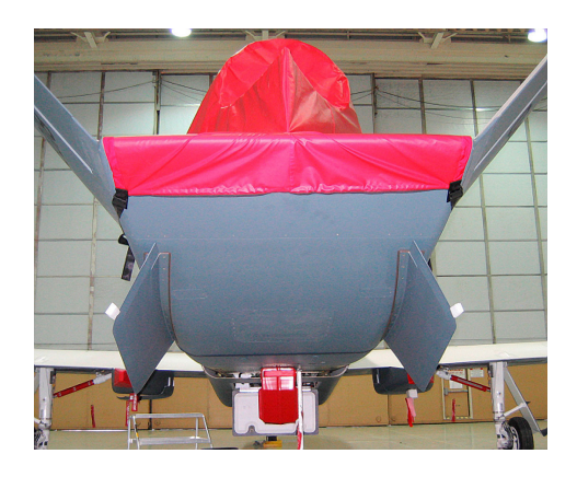
Global Hawk Exhaust Cover