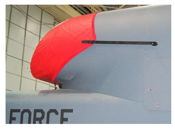
Global Hawk Intake Cover