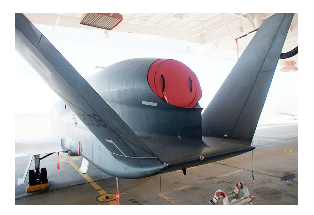
RQ-4/MQ-4 Global Hawk Exhaust Plug w/ lip (Fits both A & B models & all blocks)