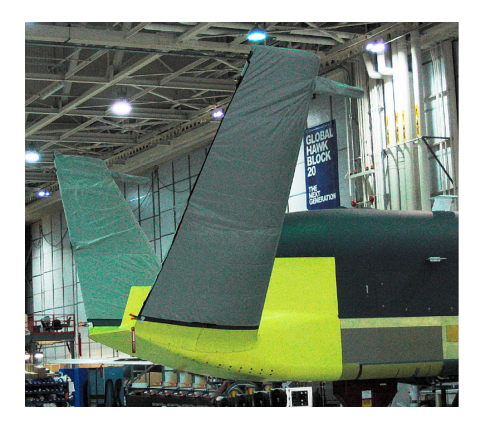
Glabal Hawk V-tail Stabilizer Covers