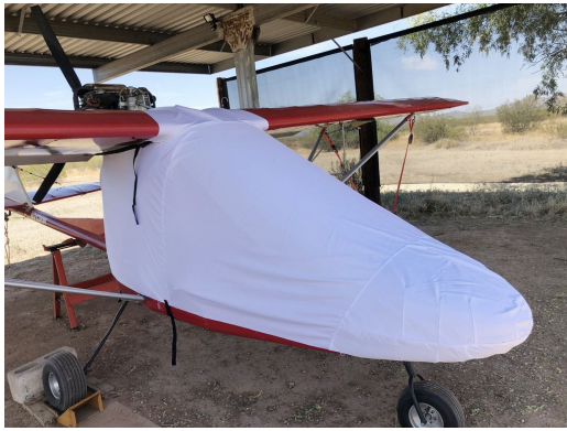
Rans S-12 Airaile Canopy/Nose Cover (test fit cover)