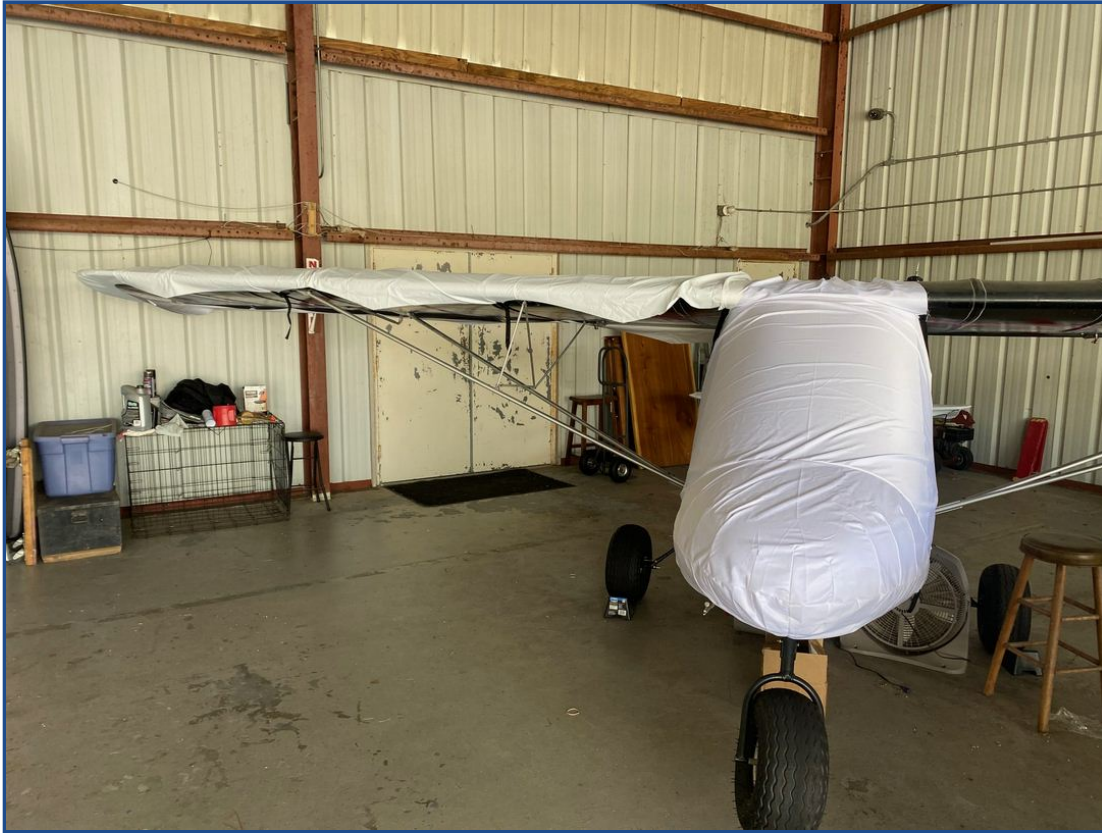
Rans S-12 Canopy/Nose &amp; Wing Covers, test fit