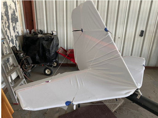
Rans S-12 Empennage Cover, test fit

WINTER USE MATERIAL - Made with Solution-Dyed Polyester fabric, this option is intended for seasonal use to aid in deicing, rain mitigation, or for occasional travel. The material is lighter and more compact, but more susceptible to UV damage and may have a shorter useful life if used continuously outside than the all-year use material.