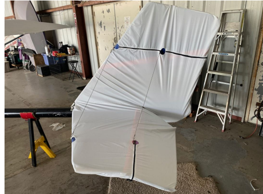
Rans S-12 Empennage Cover, test fit