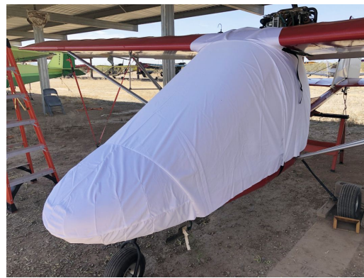
Rans S-12 Airaile Canopy/Nose Cover (test fit cover)