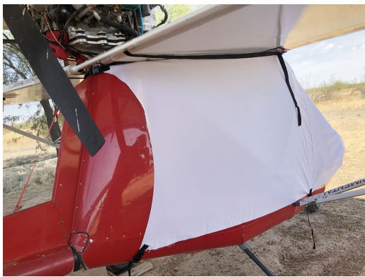
Rans S-12 Airaile Canopy/Nose Cover (test fit cover)