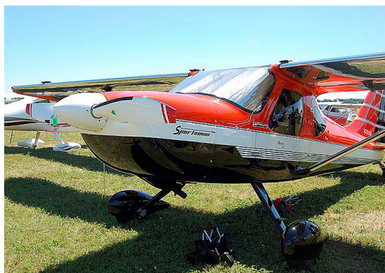
Glastar Sportsman Windshield HeatShield