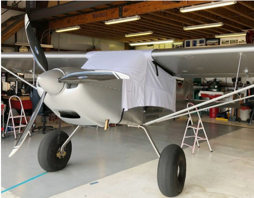
Rans S-20 Canopy Cover, test fit cover

This cover type is made from Silver Acrylic Sunbrella canvas and is 100% lined with a soft and smooth microfiber. Bruce's Custom Covers developed this material combination especially for aircraft protection. The outer material is medium weight and treated for water resistance, UV resistance and anti-static buildup. The inner lining is a very soft and smooth microfiber to prevent scratching. The material is very reflective, and tests show that the cabin interior temperature can be reduced to near-ambient temperature on the hottest of days. It is water, ice and snow repellent, yet breathable to allow moisture to escape from between the cover and the aircraft surface.