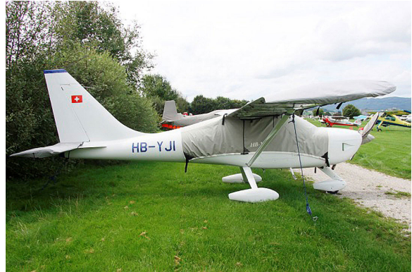
Glasstar Canopy, Wings, Horizontal Stab. & Prop Covers