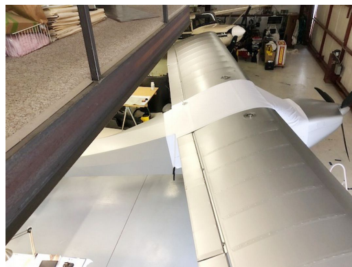
Rans S-20 Canopy Cover, test fit cover