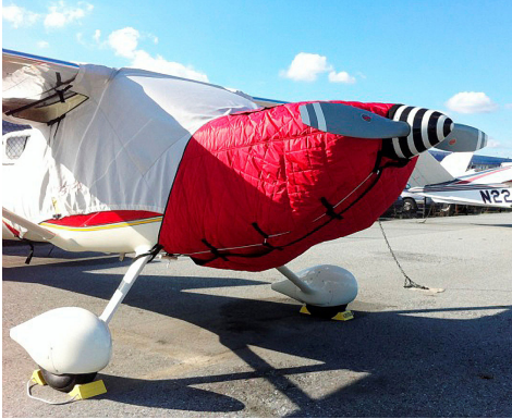
Glastar Insulated Engine Cover

This cover type is made from Silver Acrylic Sunbrella canvas and is 100% lined with a soft and smooth microfiber. Bruce's Custom Covers developed this material combination especially for aircraft protection. The outer material is medium weight and treated for water resistance, UV resistance and anti-static buildup. The inner lining is a very soft and smooth microfiber to prevent scratching. The material is very reflective, and tests show that the cabin interior temperature can be reduced to near-ambient temperature on the hottest of days. It is water, ice and snow repellent, yet breathable to allow moisture to escape from between the cover and the aircraft surface.