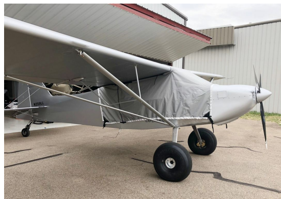
RANS S20 TRAVEL COVER

Travel Covers are made with Silver Solution-Dyed Polyester fabric and only lined over the windshield to save weight. The material is lightweight and more compact for easy stowage in the aircraft. The polyester material is water resistant, but only intended for occasional use outside. We also have an ultra lightweight material available for fitted hangar dust covers. For daily outdoor use, the non-travel Sunbrella Cover is the best choice.