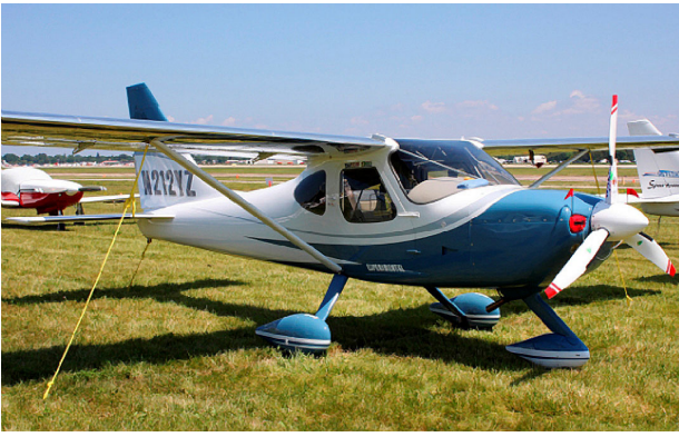
Glastar Sportsman Engine Inlet Plugs