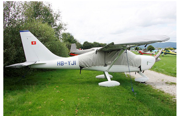
Glaxtar Canopy, Wings, Horizontal Stab. & Prop Covers