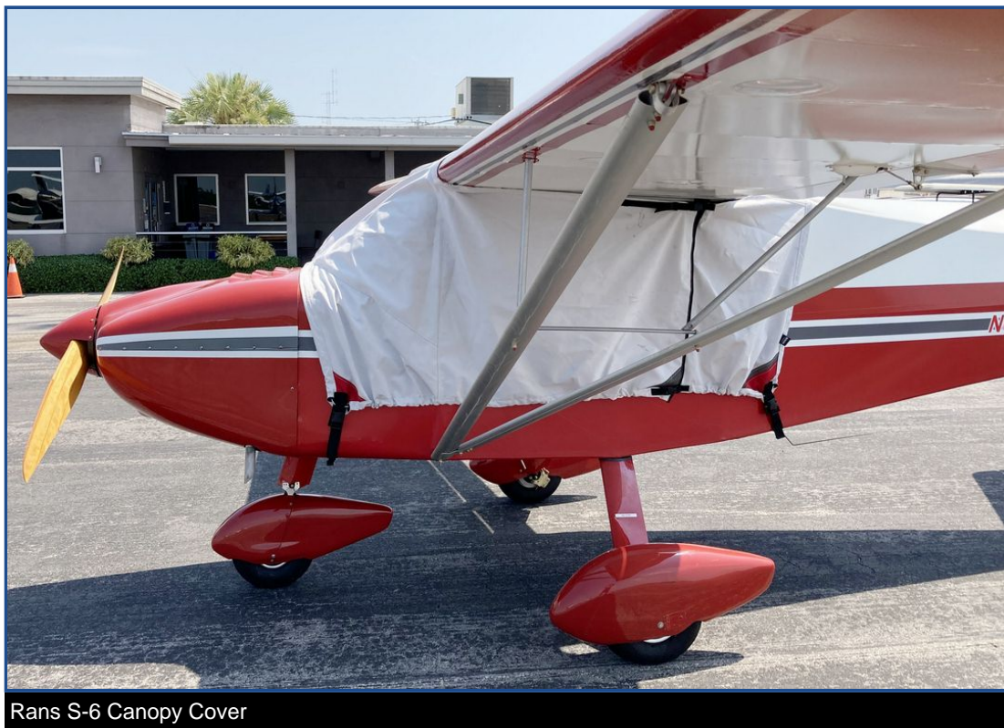
Rans S-6 Canopy Cover