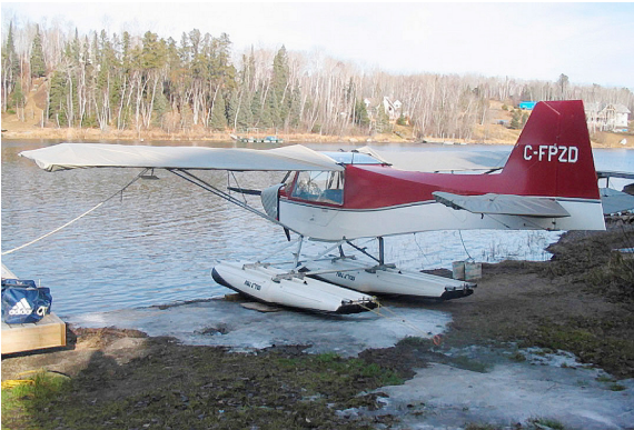
Rans S-7 Insulated Engine Cover, Wing Covers and Horizontal Stabilizer Covers