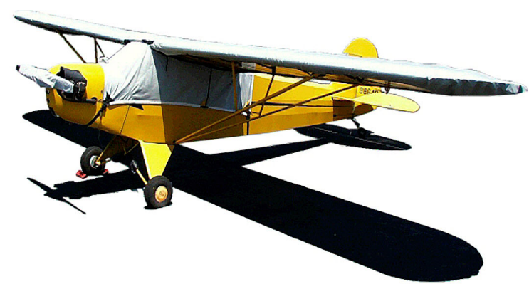
Piper J3 Canopy, Wing and Prop Covers

This cover type is made from Silver Acrylic Sunbrella canvas and is 100% lined with a soft and smooth microfiber. Bruce's Custom Covers developed this material combination especially for aircraft protection. The outer material is medium weight and treated for water resistance, UV resistance and anti-static buildup. The inner lining is a very soft and smooth microfiber to prevent scratching. The material is very reflective, and tests show that the cabin interior temperature can be reduced to near-ambient temperature on the hottest of days. It is water, ice and snow repellent, yet breathable to allow moisture to escape from between the cover and the aircraft surface.