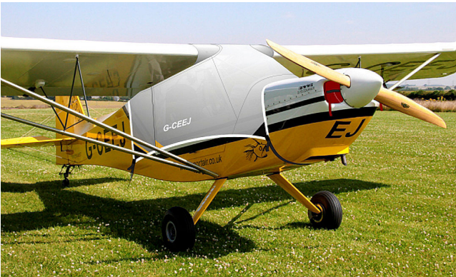
Rans Canopy Cover & Engine Plugs (illustration on a Rans S-7)