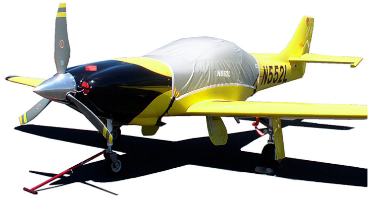
Canopy Cover for Lancair Legacy