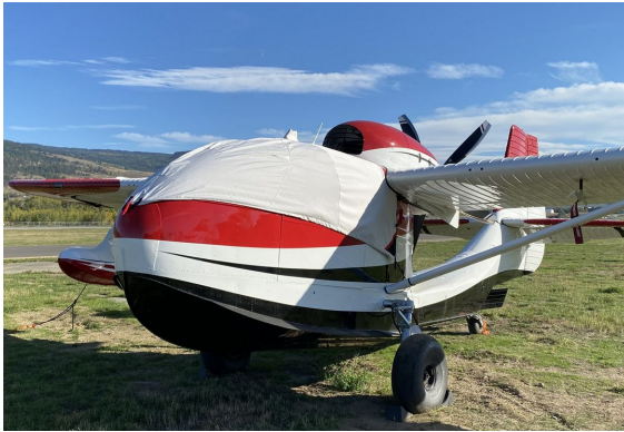
Republic Seabee Canopy Cover

The material is very reflective, and tests show that the cabin interior temperature can be reduced to near-ambient temperature on the hottest of days. It is water, ice and snow repellent, yet breathable to allow moisture to escape from between the cover and the aircraft surface.