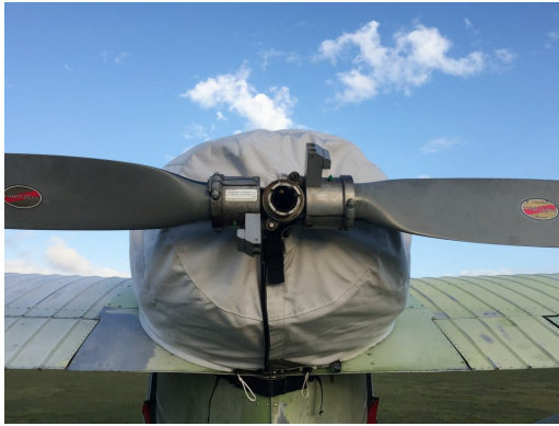
Republic Seabee Engine Cover

water resistance, UV resistance and anti-static buildup. The inner lining is a very soft and smooth microfiber to prevent scratching. The material is very reflective, and tests show that the cabin interior temperature can be reduced to near-ambient temperature on the hottest of days. It is water, ice and snow repellent, yet breathable to allow moisture to escape from between the cover and the aircraft surface.