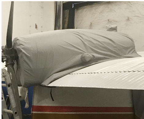
Republic Seabee Amphibian Engine Cover

water resistance, UV resistance and anti-static buildup. The inner lining is a very soft and smooth microfiber to prevent scratching. The material is very reflective, and tests show that the cabin interior temperature can be reduced to near-ambient temperature on the hottest of days. It is water, ice and snow repellent, yet breathable to allow moisture to escape from between the cover and the aircraft surface.