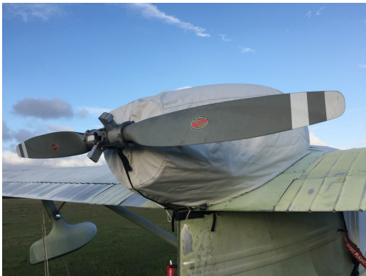
Republic Seabee Engine Cover