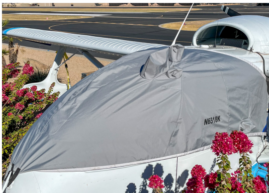
Seabee Amphibian Travel Cover, Light Weight Canopy Cover

This cover type is made from Silver Acrylic Sunbrella canvas and is 100% lined with a soft and smooth microfiber. Bruce's Custom Covers developed this material combination especially for aircraft protection. The outer material is medium weight and treated for water resistance, UV resistance and anti-static buildup. The inner lining is a very soft and smooth microfiber to prevent scratching. The material is very reflective, and tests show that the cabin interior temperature can be reduced to near-ambient temperature on the hottest of days. It is water, ice and snow repellent, yet breathable to allow moisture to escape from between the cover and the aircraft surface.