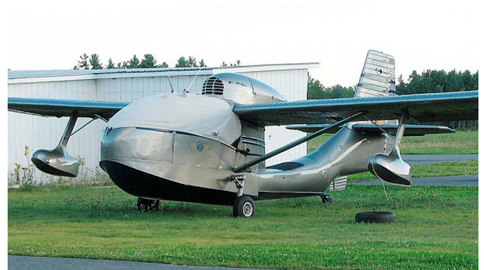
Seabee Canopy Cover