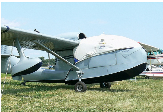
Republic Seabee Canopy Cover

This cover type is made from Silver Acrylic Sunbrella canvas and is 100% lined with a soft and smooth microfiber. Bruce's Custom Covers developed this material combination especially for aircraft protection. The outer material is medium weight and treated for water resistance, UV resistance and anti-static buildup. The inner lining is a very soft and smooth microfiber to prevent scratching. The material is very reflective, and tests show that the cabin interior temperature can be reduced to near-ambient temperature on the hottest of days. It is water, ice and snow repellent, yet breathable to allow moisture to escape from between the cover and the aircraft surface.