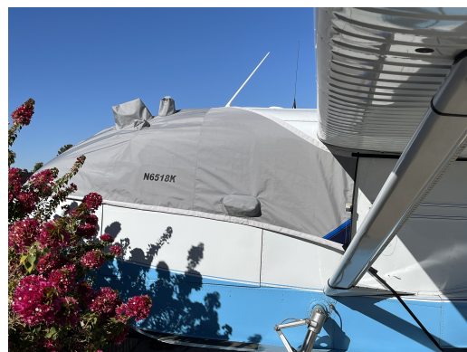
Seabee Amphibian Travel Cover, Light Weight Canopy Cover