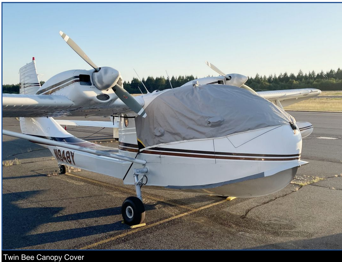
Twin Bee Canopy Cover