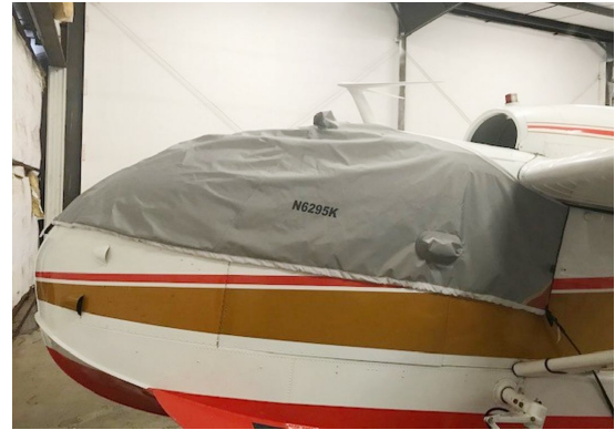
Republic Seabee Canopy Cover