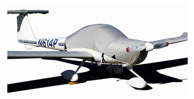
DA-20 Canopy/Engine, Prop/Spinner, Wing, Tailboom, Horiz. Stab. Covers

Diamond DA-20 Canopy/Engine, Wing & Horiz. Stab. Covers