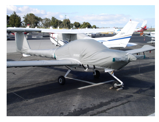
Diamond DA-20-C1 Insulated Engine Cover