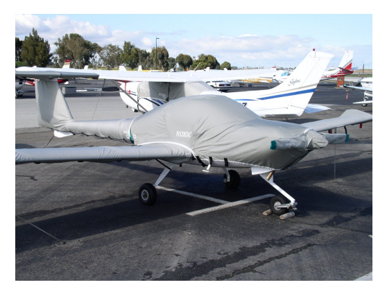
DA-20 Full Cover Set

This cover type is made from Silver Acrylic Sunbrella canvas and is 100% lined with a soft and smooth microfiber. Bruce's Custom Covers developed this material combination especially for aircraft protection. The outer material is medium weight and treated for water resistance, UV resistance and anti-static buildup. The inner lining is a very soft and smooth microfiber to prevent scratching. The material is very reflective, and tests show that the cabin interior temperature can be reduced to near-ambient temperature on the hottest of days. It is water, ice and snow repellent, yet breathable to allow moisture to escape from between the cover and the aircraft surface.