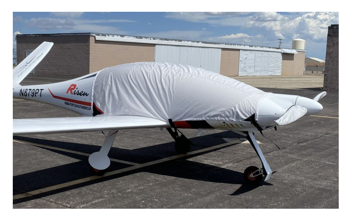
Swiss Excellence Risen 914 Canopy Cover