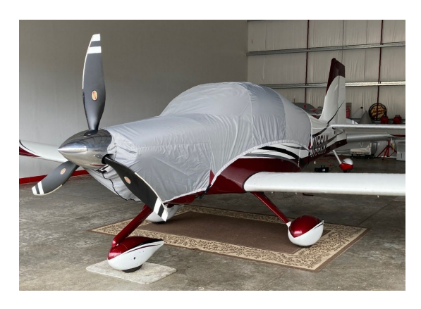
Van's RV-10 Travel Cover