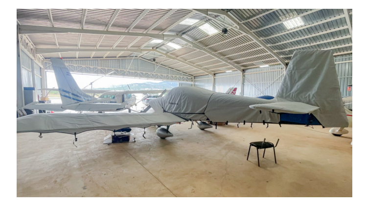
Van's RV-10 Full Cover Set

This cover type is made from Silver Acrylic Sunbrella canvas and is 100% lined with a soft and smooth microfiber. Bruce's Custom Covers developed this material combination especially for aircraft protection. The outer material is medium weight and treated for water resistance, UV resistance and anti-static buildup. The inner lining is a very soft and smooth microfiber to prevent scratching. The material is very reflective, and tests show that the cabin interior temperature can be reduced to near-ambient temperature on the hottest of days. It is water, ice and snow repellent, yet breathable to allow moisture to escape from between the cover and the aircraft surface.