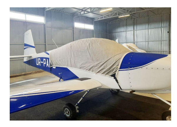
Van's RV-10 Travel Weight Canopy Cover

Travel Covers are made with Silver Solution-Dyed Polyester fabric and only lined over the windshield to save weight. The material is lightweight and more compact for easy stowage in the aircraft. The polyester material is water resistant, but only intended for occasional use outside. We also have an ultra lightweight material available for fitted hangar dust covers. For daily outdoor use, the non-travel Sunbrella Cover is the best choice.