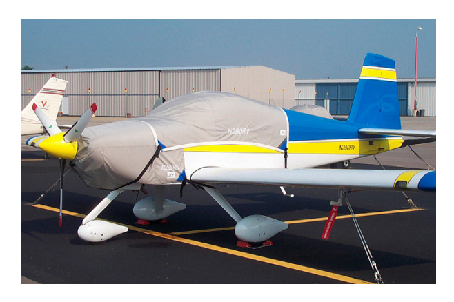
Van's RV-9 Canopy & Engine Covers