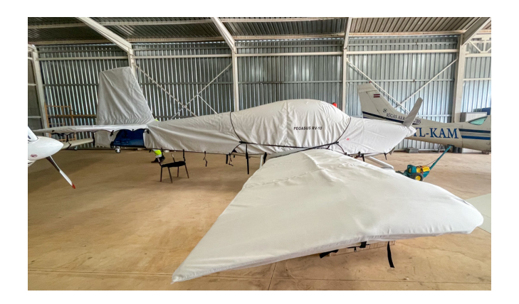
Van's RV-10 Full Cover Set