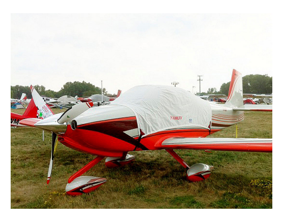
Van's RV-10 Canopy Cover