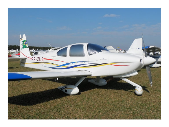
Van's RV-10 HeatShield Set