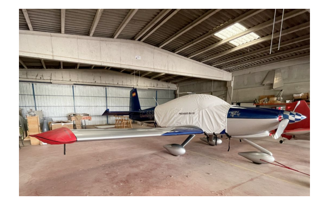
Van's RV-10 Extended Canopy Cover, Wingtip Pads

Engine Inlet Plugs are custom fit for your Van's Aircraft RV-10 intakes, made with heavy-duty vinyl material, and stuffed with a single block of sculpted urethane foam. Each plug has a zipper that allows the foam to be removed and dried if necessary. Engine plugs have warning flags that are visible from the cockpit or 'remove before flight' streamers sewn onto the face of the plugs. Most plugs are imprinted with the aircraft registration number in black for an extra charge. Storage bag NOT included. Engine plugs may be inserted after flight when the engine is still warm. Engine Inlet Plugs are commonly referred to as Cowl Plugs, Intake Plugs, Cowl Blocks, Engine Blocks, and Engine Bungs.