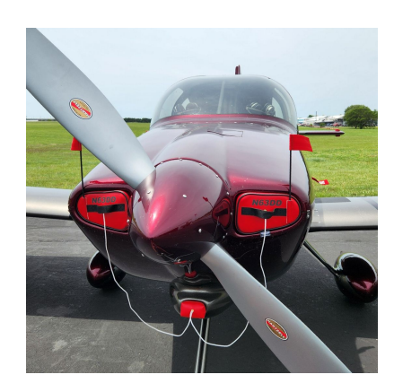
RV-10 Engine Inlet Plugs