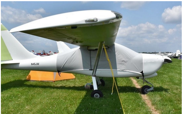
Glastar Travel Cover

Travel Covers are made with Silver Solution-Dyed Polyester fabric and only lined over the windshield to save weight. The material is lightweight and more compact for easy stowage in the aircraft. The polyester material is water resistant, but only intended for occasional use outside. We also have an ultra lightweight material available for fitted hangar dust covers. For daily outdoor use, the non-travel Sunbrella Cover is the best choice.