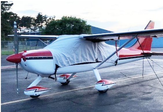
Glasair Aviation Glastar, Sportsman 2+2 Canopy Cover (Over-The-Top Style)

This cover type is made from Silver Acrylic Sunbrella canvas and is 100% lined with a soft and smooth microfiber. Bruce's Custom Covers developed this material combination especially for aircraft protection. The outer material is medium weight and treated for water resistance, UV resistance and anti-static buildup. The inner lining is a very soft and smooth microfiber to prevent scratching. The material is very reflective, and tests show that the cabin interior temperature can be reduced to near-ambient temperature on the hottest of days. It is water, ice and snow repellent, yet breathable to allow moisture to escape from between the cover and the aircraft surface.