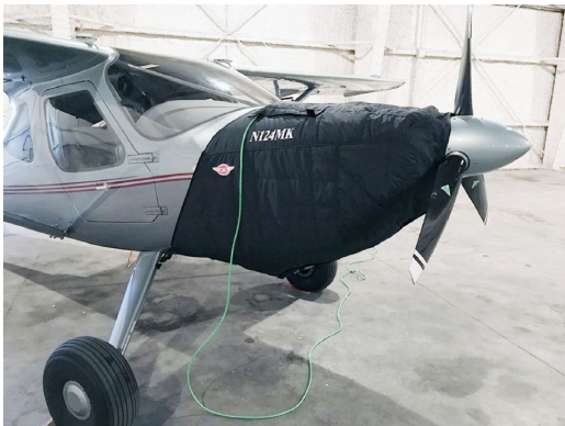
Glasair Aviation Glastar, Sportsman 2+2 Insulated Engine Cover

This cover type is made from Silver Acrylic Sunbrella canvas and is 100% lined with a soft and smooth microfiber. Bruce's Custom Covers developed this material combination especially for aircraft protection. The outer material is medium weight and treated for water resistance, UV resistance and anti-static buildup. The inner lining is a very soft and smooth microfiber to prevent scratching. The material is very reflective, and tests show that the cabin interior temperature can be reduced to near-ambient temperature on the hottest of days. It is water, ice and snow repellent, yet breathable to allow moisture to escape from between the cover and the aircraft surface.