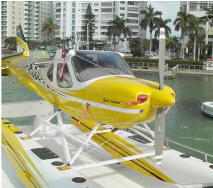
Glstar Engine Plugs

Engine Inlet Plugs are custom fit for your Van's Aircraft RV-15 intakes, made with heavy-duty vinyl material, and stuffed with a single block of sculpted urethane foam. Each plug has a zipper that allows the foam to be removed and dried if necessary. Engine plugs have warning flags that are visible from the cockpit or 'remove before flight' streamers sewn onto the face of the plugs. Most plugs are imprinted with the aircraft registration number in black for an extra charge. Storage bag NOT included. Engine plugs may be inserted after flight when the engine is still warm. Engine Inlet Plugs are commonly referred to as Cowl Plugs, Intake Plugs, Cowl Blocks, Engine Blocks, and Engine Bungs.