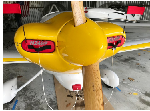
Van's RV-4 Engine Inlet Plugs