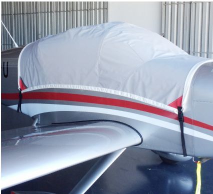
Vans's RV-9 Light Weight Travel Canopy Cover

Travel Covers are made with Silver Solution-Dyed Polyester fabric and only lined over the windshield to save weight. The material is lightweight and more compact for easy stowage in the aircraft. The polyester material is water resistant, but only intended for occasional use outside. We also have an ultra lightweight material available for fitted hangar dust covers. For daily outdoor use, the non-travel Sunbrella Cover is the best choice.