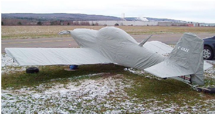
Van's RV-4 Complete Fuselage/Wing/Tail Surfaces cover

This cover type is made from Silver Acrylic Sunbrella canvas and is 100% lined with a soft and smooth microfiber. Bruce's Custom Covers developed this material combination especially for aircraft protection. The outer material is medium weight and treated for water resistance, UV resistance and anti-static buildup. The inner lining is a very soft and smooth microfiber to prevent scratching. The material is very reflective, and tests show that the cabin interior temperature can be reduced to near-ambient temperature on the hottest of days. It is water, ice and snow repellent, yet breathable to allow moisture to escape from between the cover and the aircraft surface.