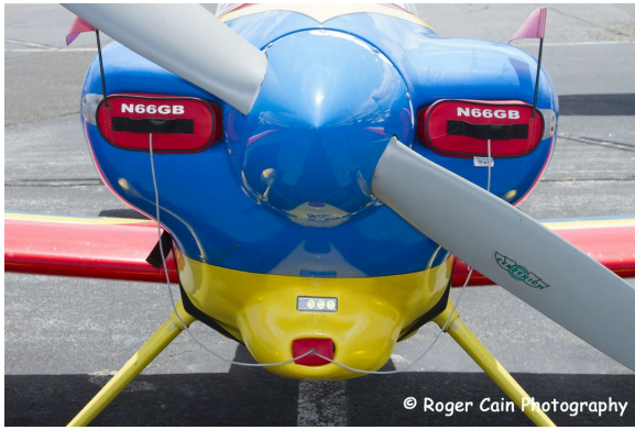
Van's RV-3 Engine Plugs