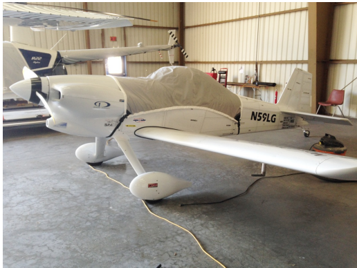
Van's RV-3 Light Weight Travel Cover