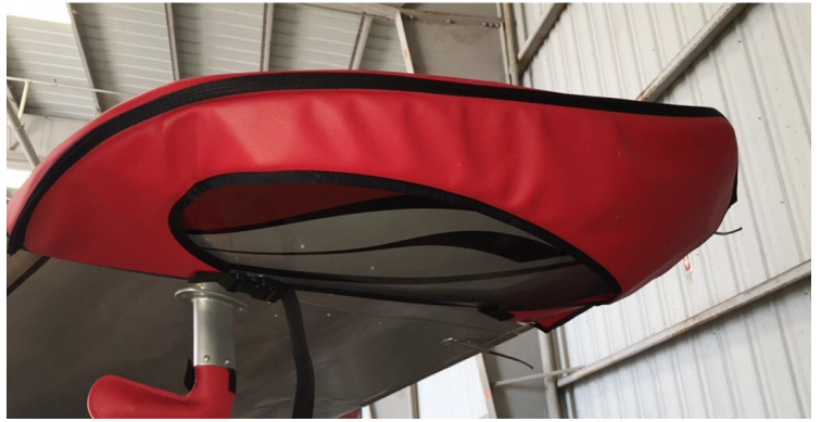
Cirrus SR-22 Wingtip Pad (also available for the Horiz. Stab.