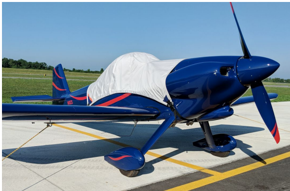
Van's RV-3 Canopy Cover