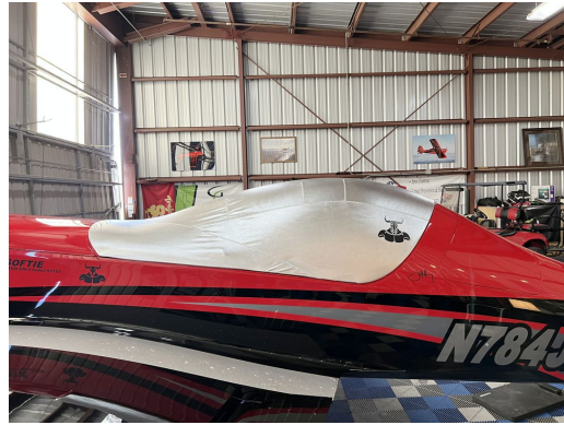
Gamebird GB-1 Solar Cap (single place), CUSTOM COVERS & IMPRINTING AVAILABLE!