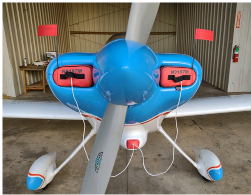
Van's Aircraft RV-4 Engine Inlet Plugs

Engine Inlet Plugs are custom fit for your Van's Aircraft RV-4 intakes, made with heavy-duty vinyl material, and stuffed with a single block of sculpted urethane foam. Each plug has a zipper that allows the foam to be removed and dried if necessary. Engine plugs have warning flags that are visible from the cockpit or 'remove before flight' streamers sewn onto the face of the plugs. Most plugs are imprinted with the aircraft registration number in black for an extra charge. Storage bag NOT included. Engine plugs may be inserted after flight when the engine is still warm. Engine Inlet Plugs are commonly referred to as Cowl Plugs, Intake Plugs, Cowl Blocks, Engine Blocks, and Engine Bungs.