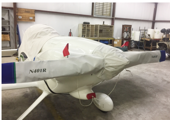
Van's Aircraft RV-4 Propellor/Spinner Cover, 2 Blade

This cover type is made from Silver Acrylic Sunbrella canvas and is 100% lined with a soft and smooth microfiber. Bruce's Custom Covers developed this material combination especially for aircraft protection. The outer material is medium weight and treated for water resistance, UV resistance and anti-static buildup. The inner lining is a very soft and smooth microfiber to prevent scratching. The material is very reflective, and tests show that the cabin interior temperature can be reduced to near-ambient temperature on the hottest of days. It is water, ice and snow repellent, yet breathable to allow moisture to escape from between the cover and the aircraft surface.