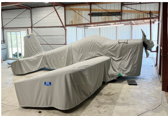
Van's Aircraft RV-7 Hangar Use Dust Cover

Some high value aircraft end up logging lots of hangar time, and become dust magnets in the process. A high quality, well fitting dust cover provides easy assurance that the aircraft's surfaces remain clean and free of grit and grime. Available in a large variety of colors, each dust cover is custom made according to aircraft details and customer preferences. Fire retardant fabrics are also available.