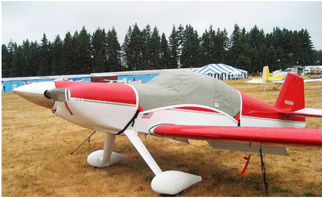
Harmon Rocket Canopy Cover & Engine Inlet Plugs

Travel Covers are made with Silver Solution-Dyed Polyester fabric and only lined over the windshield to save weight. The material is lightweight and more compact for easy stowage in the aircraft. The polyester material is water resistant, but only intended for occasional use outside. We also have an ultra lightweight material available for fitted hangar dust covers. For daily outdoor use, the non-travel Sunbrella Cover is the best choice.