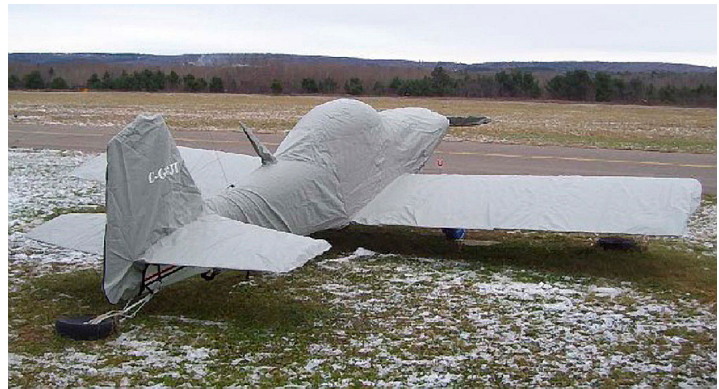
Van's RV-4 Complete Fuselage/Wing/Tail Surfaces cover