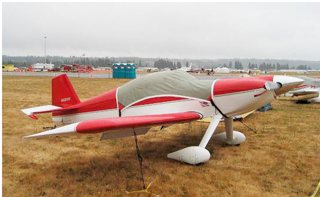
Harmon Rocket Canopy Cover & Engine Inlet Plugs

This cover type is made from Silver Acrylic Sunbrella canvas and is 100% lined with a soft and smooth microfiber. Bruce's Custom Covers developed this material combination especially for aircraft protection. The outer material is medium weight and treated for water resistance, UV resistance and anti-static buildup. The inner lining is a very soft and smooth microfiber to prevent scratching. The material is very reflective, and tests show that the cabin interior temperature can be reduced to near-ambient temperature on the hottest of days. It is water, ice and snow repellent, yet breathable to allow moisture to escape from between the cover and the aircraft surface.