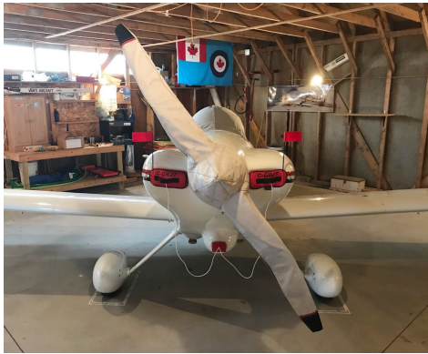
Van's RV-4 Prop Cover, Engine Inlet Plugs

Engine Inlet Plugs are custom fit for your Van's Aircraft RV-4 intakes, made with heavy-duty vinyl material, and stuffed with a single block of sculpted urethane foam. Each plug has a zipper that allows the foam to be removed and dried if necessary. Engine plugs have warning flags that are visible from the cockpit or 'remove before flight' streamers sewn onto the face of the plugs. Most plugs are imprinted with the aircraft registration number in black for an extra charge. Storage bag NOT included. Engine plugs may be inserted after flight when the engine is still warm. Engine Inlet Plugs are commonly referred to as Cowl Plugs, Intake Plugs, Cowl Blocks, Engine Blocks, and Engine Bungs.