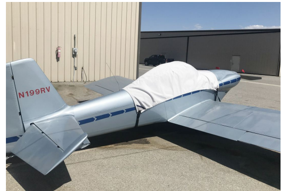
Van's RV-4 Canopy Cover