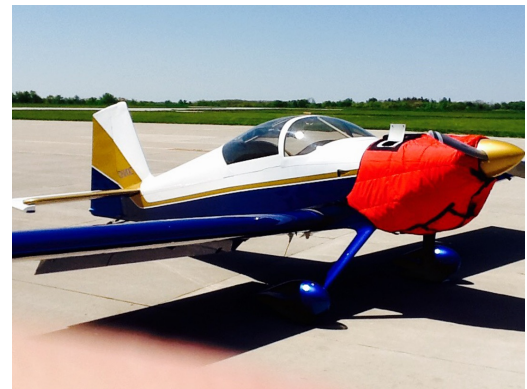
Van's RV-7 Insulated Engine Cover