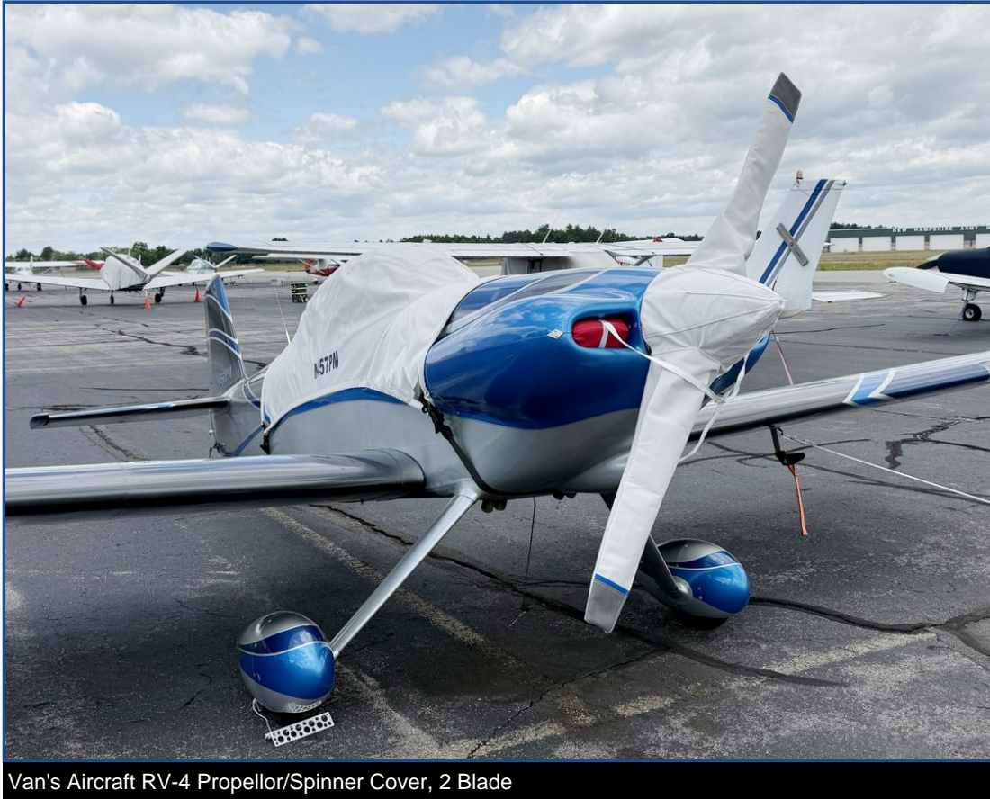
Van's Aircraft RV-4 Propellor/Spinner Cover, 2 Blade