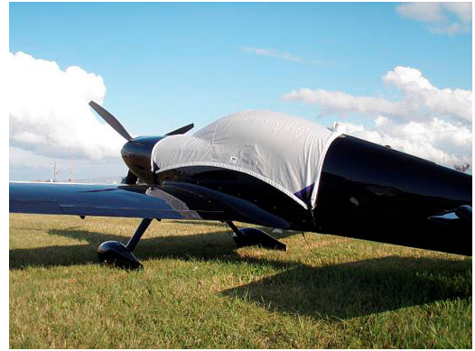
Harmon Rocket Canopy Cover