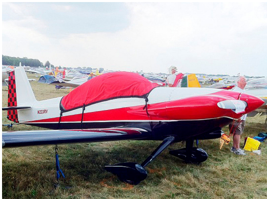
Vans's RV-4 Canopy Cover

This cover type is made from Silver Acrylic Sunbrella canvas and is 100% lined with a soft and smooth microfiber. Bruce's Custom Covers developed this material combination especially for aircraft protection. The outer material is medium weight and treated for water resistance, UV resistance and anti-static buildup. The inner lining is a very soft and smooth microfiber to prevent scratching. The material is very reflective, and tests show that the cabin interior temperature can be reduced to near-ambient temperature on the hottest of days. It is water, ice and snow repellent, yet breathable to allow moisture to escape from between the cover and the aircraft surface.