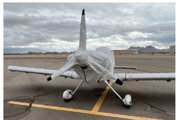
Van's RV-8 Prop Cover, 3-Blade Type