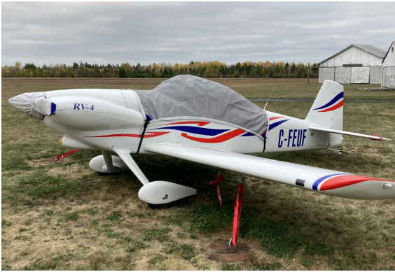
Van's RV-4 Travel Canopy Cover

Travel Covers are made with Silver Solution-Dyed Polyester fabric and only lined over the windshield to save weight. The material is lightweight and more compact for easy stowage in the aircraft. The polyester material is water resistant, but only intended for occasional use outside. We also have an ultra lightweight material available for fitted hangar dust covers. For daily outdoor use, the non-travel Sunbrella Cover is the best choice.