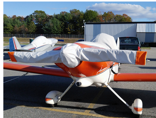
Van's RV-4 Propellor/Spinner Cover, 2 Blade