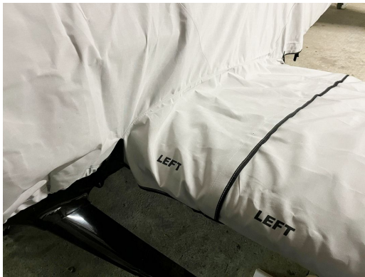
Van's Aircraft RV-4 Complete Fuselage Cover W/Detachable Wing Covers

This cover type is made from Silver Acrylic Sunbrella canvas and is 100% lined with a soft and smooth microfiber. Bruce's Custom Covers developed this material combination especially for aircraft protection. The outer material is medium weight and treated for water resistance, UV resistance and anti-static buildup. The inner lining is a very soft and smooth microfiber to prevent scratching. The material is very reflective, and tests show that the cabin interior temperature can be reduced to near-ambient temperature on the hottest of days. It is water, ice and snow repellent, yet breathable to allow moisture to escape from between the cover and the aircraft surface.