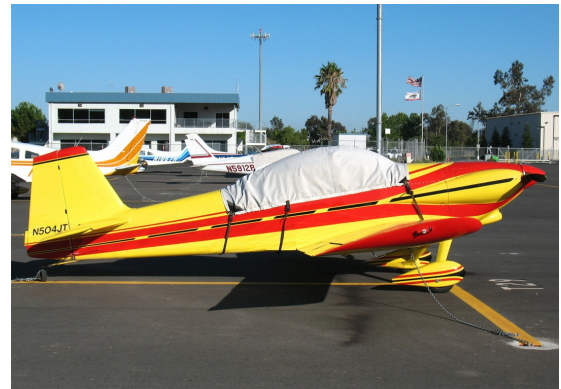
Van's RV-4 Canopy Cover