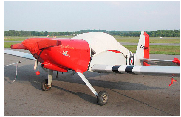
Van's RV-6 2-Blade Prop Cover