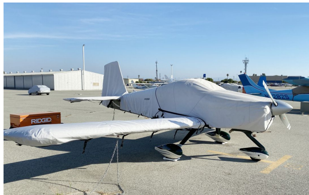
Van's RV-9A Extended Canopy/Engine, Wing & Empennage Covers