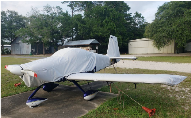
Van's RV-7A Cover Set