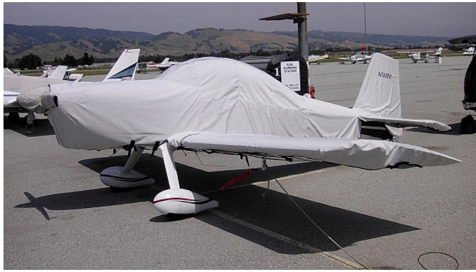
Van's RV-8 Complete Fuselage Cover w/ Detachable Wing Covers & Prop Cover