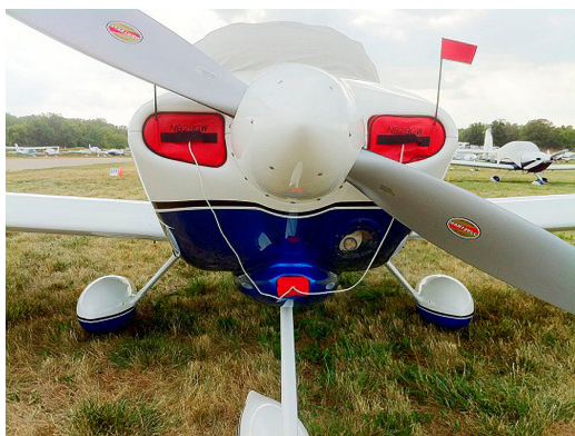
Van's RV-10 Canopy Cover & Engine Inlet Plugs