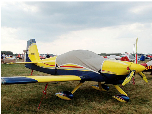
Van's RV-7 Canopy Cover & Engine Inlet Plugs

This cover type is made from Silver Acrylic Sunbrella canvas and is 100% lined with a soft and smooth microfiber. Bruce's Custom Covers developed this material combination especially for aircraft protection. The outer material is medium weight and treated for water resistance, UV resistance and anti-static buildup. The inner lining is a very soft and smooth microfiber to prevent scratching. The material is very reflective, and tests show that the cabin interior temperature can be reduced to near-ambient temperature on the hottest of days. It is water, ice and snow repellent, yet breathable to allow moisture to escape from between the cover and the aircraft surface.