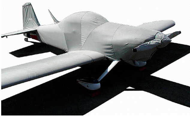
Van's RV-4 Complete Cover