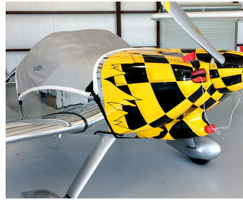
Van's RV-7 Engine Inlet Plugs