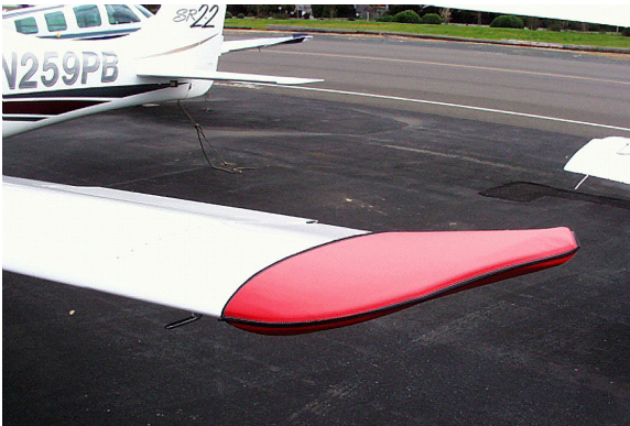
Cirrus SR-22 Wingtip Pad (also available for the Horiz. Stab.

Designed to prevent damage to the aircraft extremities in crowded hangars, these products are made of bright red Naugahyde and thickly padded with a sandwich of closed cell foam.