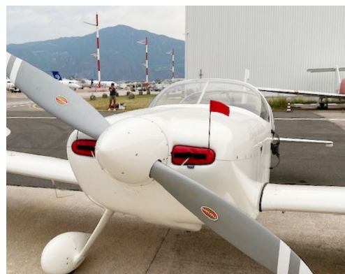
Van's RV7/7A Engine Inlet Plugs