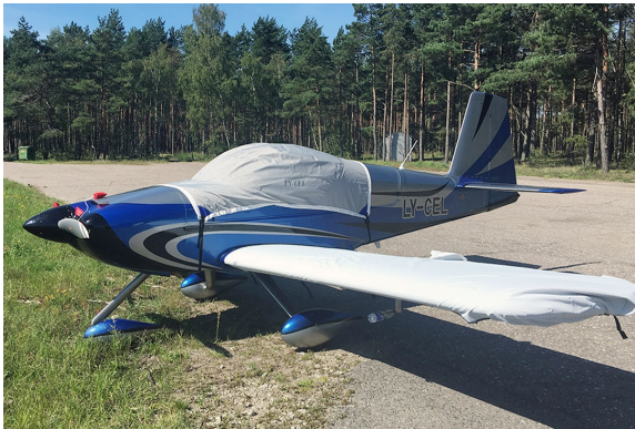
Van's RV-7/7A Travel and Wing Covers