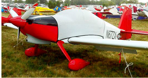
Light Weight Fitted Hangar Dust Cover

Travel Covers are made with Silver Solution-Dyed Polyester fabric and only lined over the windshield to save weight. The material is lightweight and more compact for easy stowage in the aircraft. The polyester material is water resistant, but only intended for occasional use outside. We also have an ultra lightweight material available for fitted hangar dust covers. For daily outdoor use, the non-travel Sunbrella Cover is the best choice.