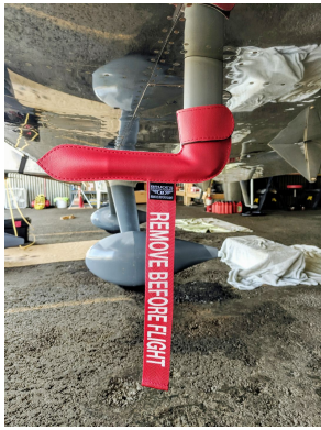
Van's RV-14 Pitot Cover