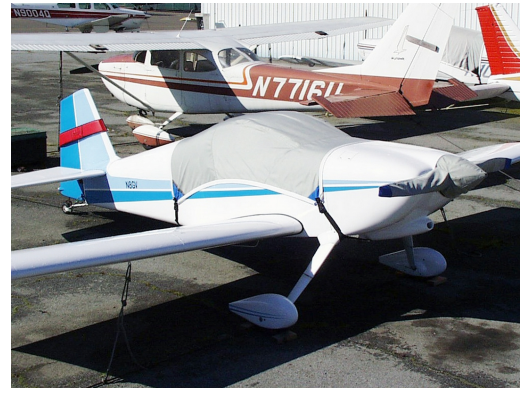
Vans's RV-6 Canopy Cover, Prop Cover