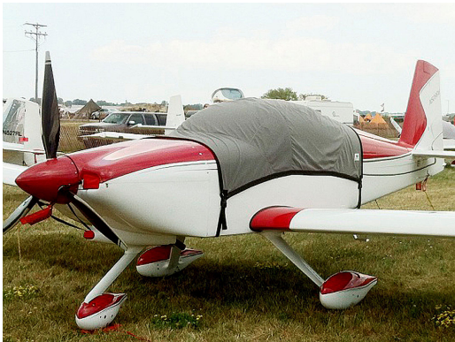
Van's RV-9 Travel Canopy Cover

Travel Covers are made with Silver Solution-Dyed Polyester fabric and only lined over the windshield to save weight. The material is lightweight and more compact for easy stowage in the aircraft. The polyester material is water resistant, but only intended for occasional use outside. We also have an ultra lightweight material available for fitted hangar dust covers. For daily outdoor use, the non-travel Sunbrella Cover is the best choice.