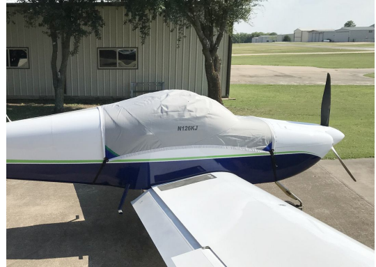
Van's RV-9A Travel Weight Canopy Cover