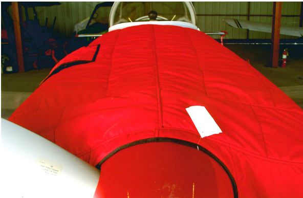
Van's RV-8/8A Insulated Engine Cover (From the Spinner Looking Aft)

This cover type is made from Silver Acrylic Sunbrella canvas and is 100% lined with a soft and smooth microfiber. Bruce's Custom Covers developed this material combination especially for aircraft protection. The outer material is medium weight and treated for water resistance, UV resistance and anti-static buildup. The inner lining is a very soft and smooth microfiber to prevent scratching. The material is very reflective, and tests show that the cabin interior temperature can be reduced to near-ambient temperature on the hottest of days. It is water, ice and snow repellent, yet breathable to allow moisture to escape from between the cover and the aircraft surface.