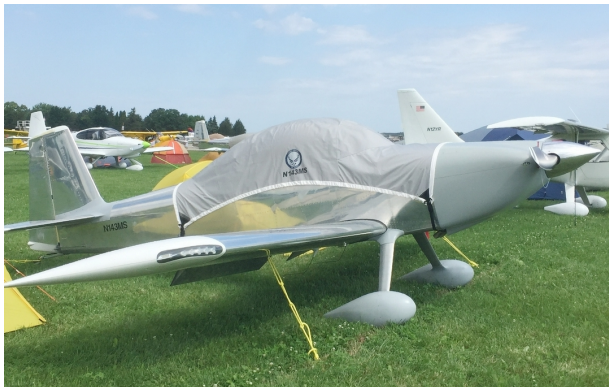
Van's Aircraft RV-8 Travel Cover, Light Weight Travel Canopy Cover

Travel Covers are made with Silver Solution-Dyed Polyester fabric and only lined over the windshield to save weight. The material is lightweight and more compact for easy stowage in the aircraft. The polyester material is water resistant, but only intended for occasional use outside. We also have an ultra lightweight material available for fitted hangar dust covers. For daily outdoor use, the non-travel Sunbrella Cover is the best choice.