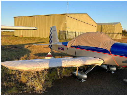
Van's Aircraft RV-8/8A Wing Covers, All Year Use

WINTER USE MATERIAL - Made with Solution-Dyed Polyester fabric, this option is intended for seasonal use to aid in deicing, rain mitigation, or for occasional travel. The material is lighter and more compact, but more susceptible to UV damage and may have a shorter useful life if used continuously outside than the all-year use material.