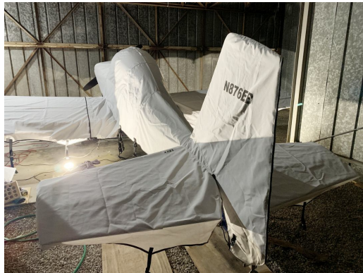
Van's RV-8 Complete Fuselage Cover with Detachable Wing Covers

This cover type is made from Silver Acrylic Sunbrella canvas and is 100% lined with a soft and smooth microfiber. Bruce's Custom Covers developed this material combination especially for aircraft protection. The outer material is medium weight and treated for water resistance, UV resistance and anti-static buildup. The inner lining is a very soft and smooth microfiber to prevent scratching. The material is very reflective, and tests show that the cabin interior temperature can be reduced to near-ambient temperature on the hottest of days. It is water, ice and snow repellent, yet breathable to allow moisture to escape from between the cover and the aircraft surface.