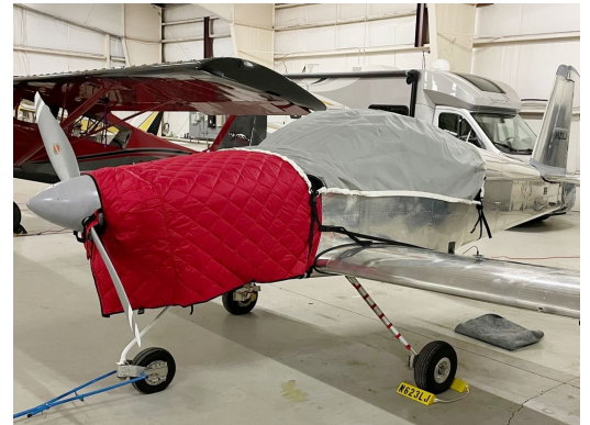
Vans RV-7 Travel Canopy Cover, Hangar Blanket