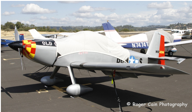
Van'ss RV-8 Canopy Cover