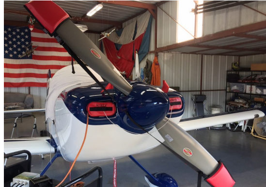
Van's RV-8 Engine Plugs, Prop Tip Protectors