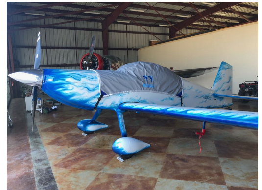
Van's RV-8 Fastback Travel Canopy Cover