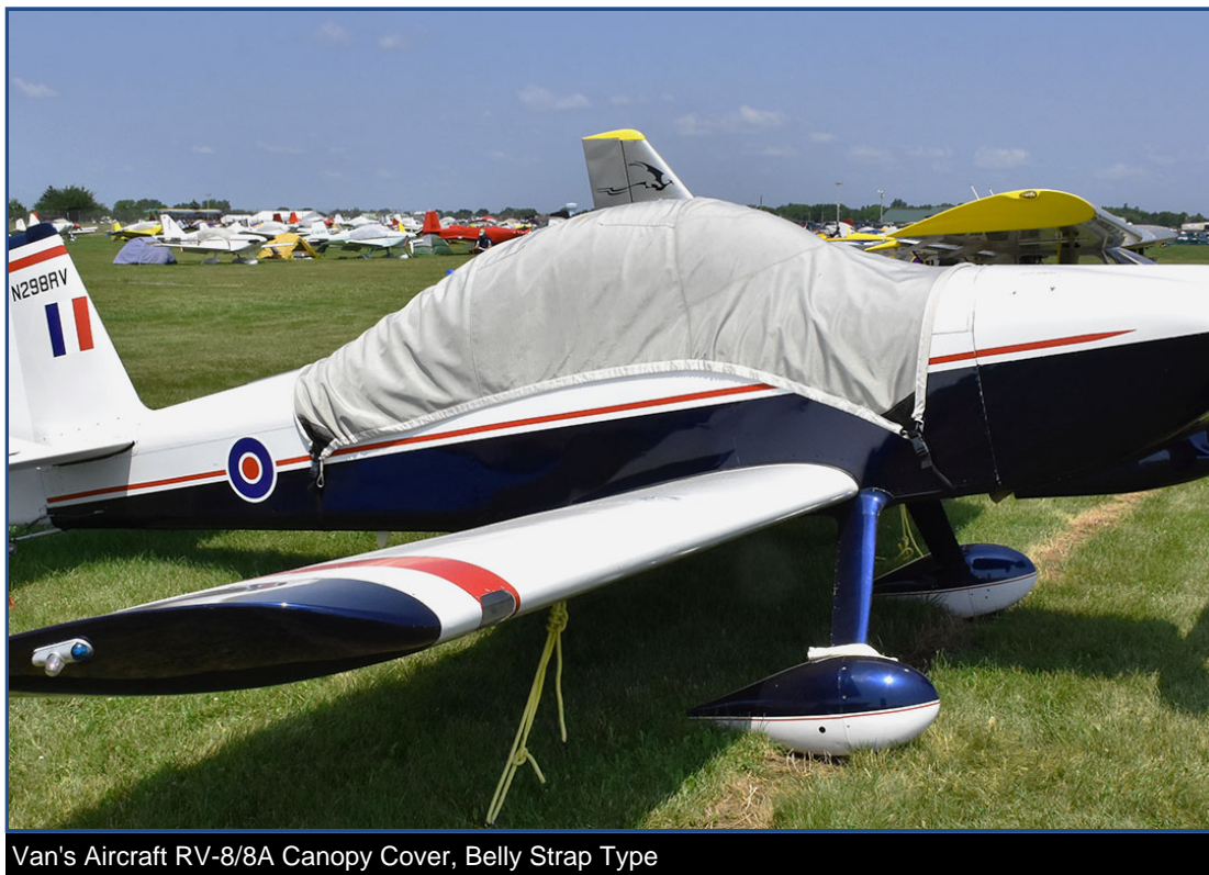
Van's Aircraft RV-8/8A Canopy Cover, Belly Strap Type