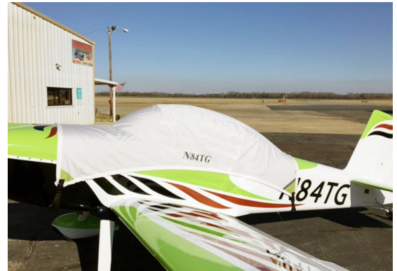
Van's RV-8/8A Canopy Cover