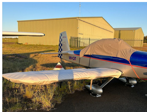
Van's Aircraft RV-8/8A Wing Covers, All Year Use

WINTER USE MATERIAL - Made with Solution-Dyed Polyester fabric, this option is intended for seasonal use to aid in deicing, rain mitigation, or for occasional travel. The material is lighter and more compact, but more susceptible to UV damage and may have a shorter useful life if used continuously outside than the all-year use material.