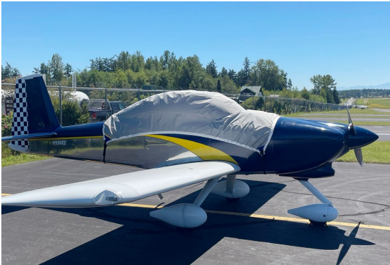
RV-8A Travel Canopy Cover