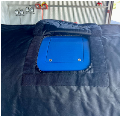
Van's RV8 Insulated Engine Cover