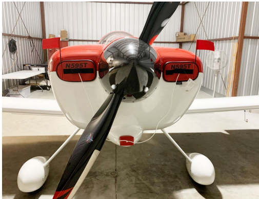
Van's RV-8 Engine Inlet Plugs

Engine Inlet Plugs are custom fit for your Van's Aircraft RV-8/8A intakes, made with heavy-duty vinyl material, and stuffed with a single block of sculpted urethane foam. Each plug has a zipper that allows the foam to be removed and dried if necessary. Engine plugs have warning flags that are visible from the cockpit or 'remove before flight' streamers sewn onto the face of the plugs. Most plugs are imprinted with the aircraft registration number in black for an extra charge. Storage bag NOT included. Engine plugs may be inserted after flight when the engine is still warm. Engine Inlet Plugs are commonly referred to as Cowl Plugs, Intake Plugs, Cowl Blocks, Engine Blocks, and Engine Bungs.