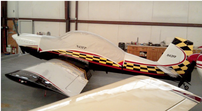
Van's Aircraft RV-8/8A Canopy Cover, Belly Strap Type (Extends To Cover Baggage Door)

This cover type is made from Silver Acrylic Sunbrella canvas and is 100% lined with a soft and smooth microfiber. Bruce's Custom Covers developed this material combination especially for aircraft protection. The outer material is medium weight and treated for water resistance, UV resistance and anti-static buildup. The inner lining is a very soft and smooth microfiber to prevent scratching. The material is very reflective, and tests show that the cabin interior temperature can be reduced to near-ambient temperature on the hottest of days. It is water, ice and snow repellent, yet breathable to allow moisture to escape from between the cover and the aircraft surface.