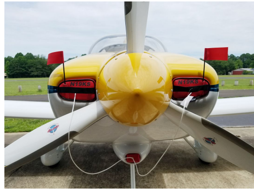
Van's RV-9A Engine Inlet Plugs