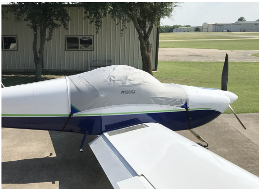
Van's RV-9A Travel Weight Canopy Cover