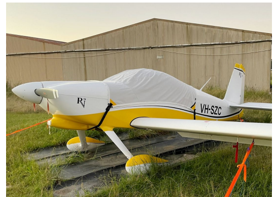
Van's RV-9A Canopy Cover