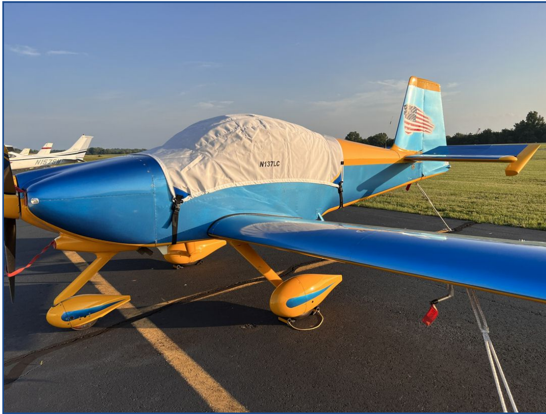
Van's RV9A Canopy Cover