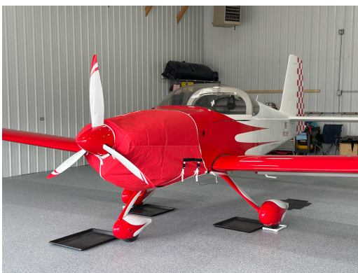
Van's RV-9A Insulated Engine Cover with oil door access