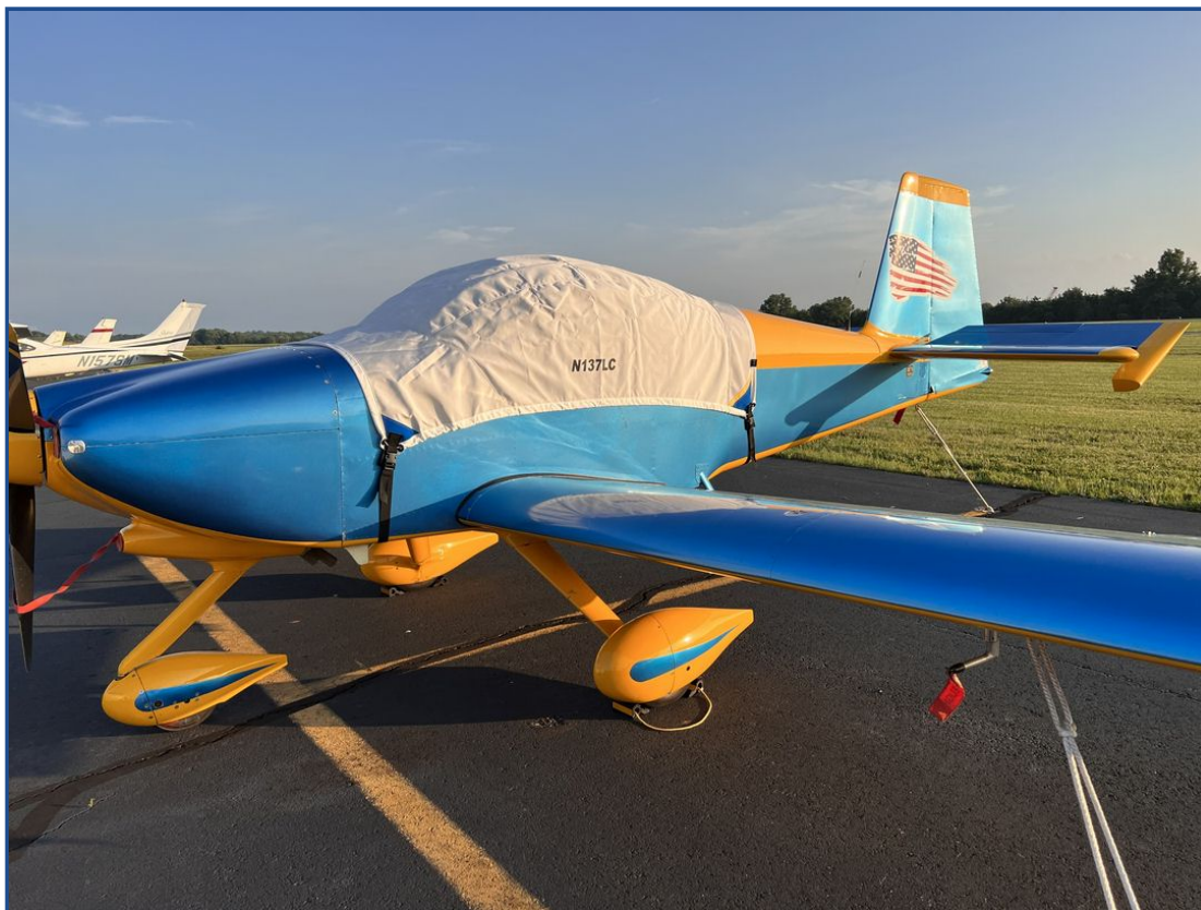
Van's RV9A Canopy Cover