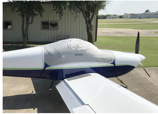
Van's RV-9A Travel Weight Canopy Cover