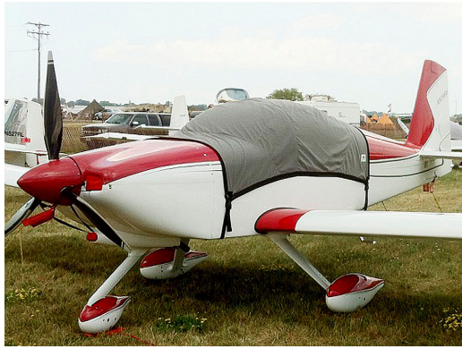
Van's RV-9 Travel Canopy Cover

occasional use outside. We also have an ultra lightweight material available for fitted hangar dust covers. For daily outdoor use, the non-travel Sunbrella Cover is the best choice.