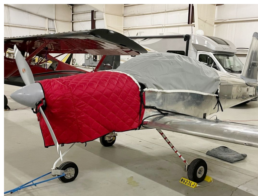
Vans RV-7 Travel Canopy Cover, Hangar Blanket