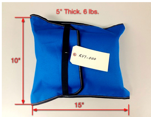
Van's RV-7/A Canopy Cover Weight & Dimensions (representative of an RV-6/A & RV-9/A cover)

This cover type is made from Silver Acrylic Sunbrella canvas and is 100% lined with a soft and smooth microfiber. Bruce's Custom Covers developed this material combination especially for aircraft protection. The outer material is medium weight and treated for water resistance, UV resistance and anti-static buildup. The inner lining is a very soft and smooth microfiber to prevent scratching. The material is very reflective, and tests show that the cabin interior temperature can be reduced to near-ambient temperature on the hottest of days. It is water, ice and snow repellent, yet breathable to allow moisture to escape from between the cover and the aircraft surface.