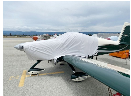
Van's RV-9A Extended Canopy/Engine Cover