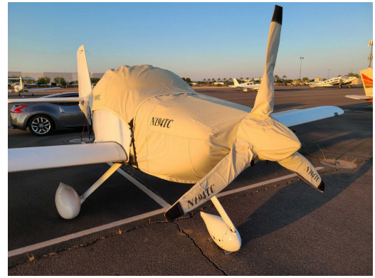
Van's RV-9 Canopy, Engine & Prop Covers