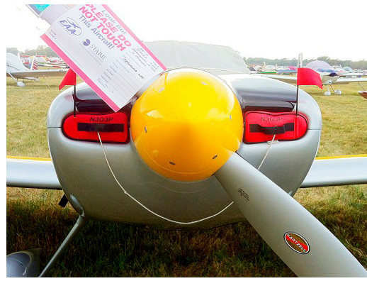
Vans's RV-7 Engine Engine Inlet Plugs