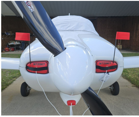
Van's Aircraft RV-9/9A Engine Inlet Plugs