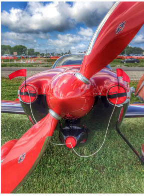
Van's RV-7 Engine Inlet Plugs