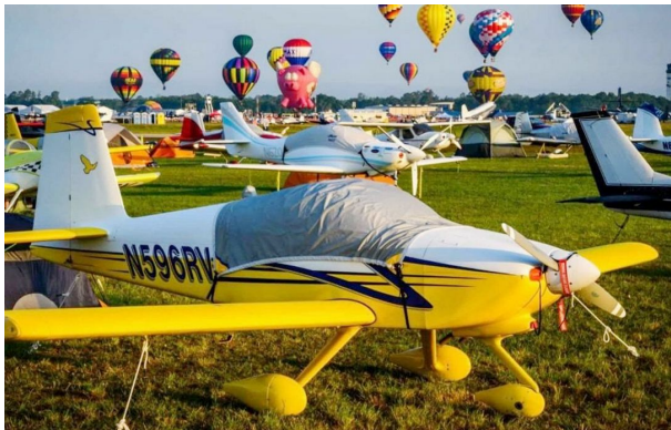
Vans's RV-9 Travel Weight Canopy Cover at Sun 'n Fun

occasional use outside. We also have an ultra lightweight material available for fitted hangar dust covers. For daily outdoor use, the non-travel Sunbrella Cover is the best choice.