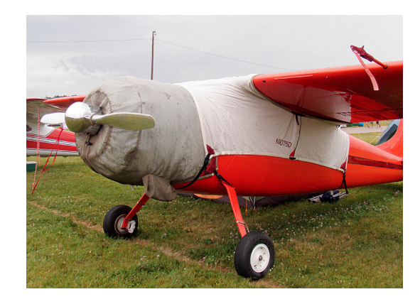
Cessna 195 Over-Top Canopy Cover & Engine Cover