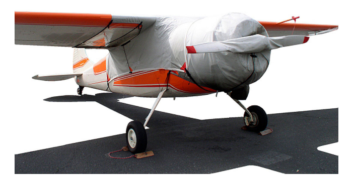
Cessna 195 Over-Top Canopy, Engine & Prop Covers

The material is very reflective, and tests show that the cabin interior temperature can be reduced to near-ambient temperature on the hottest of days. It is water, ice and snow repellent, yet breathable to allow moisture to escape from between the cover and the aircraft surface.